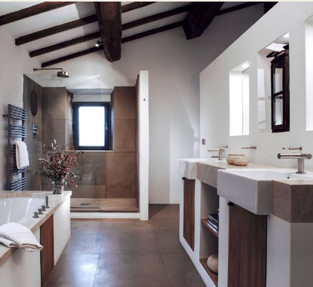
Top of the tower walk-in Bathroom behind a screen and Bedroom