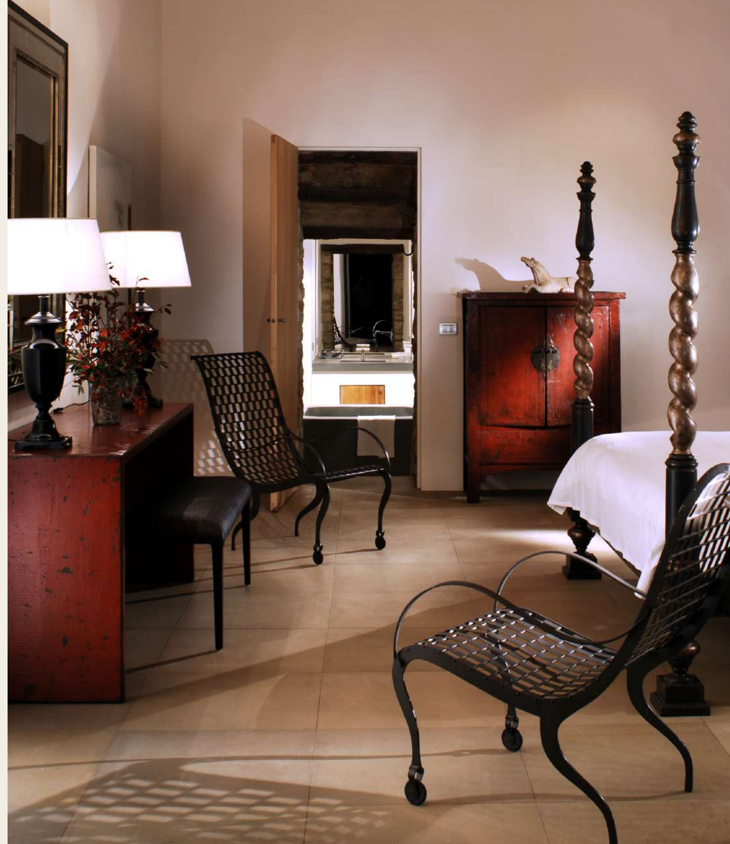
Square sandstone bath tub and details of the Ground Floor Bedroom with direct access to the extensive gardens and also the courtyard