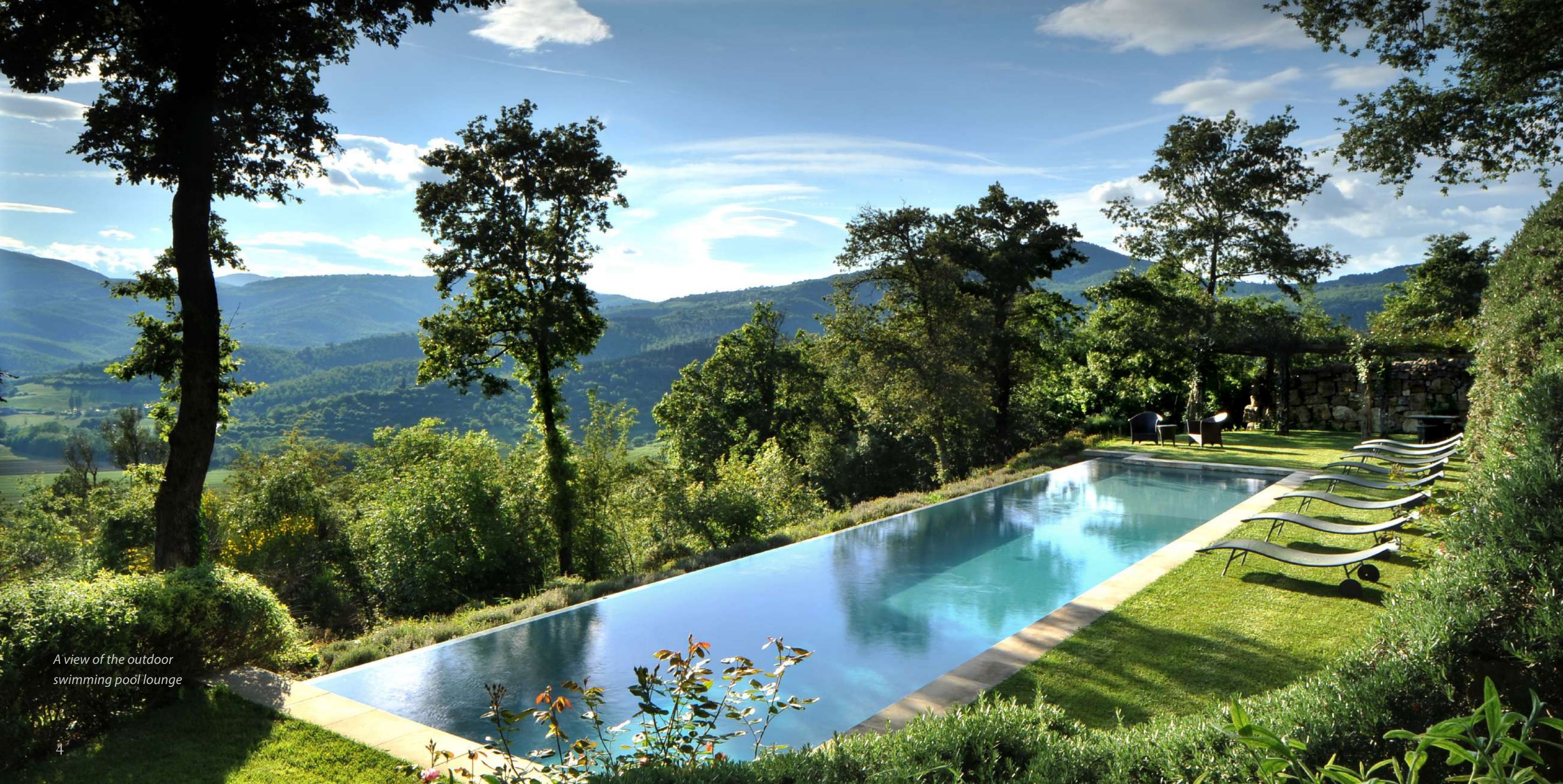
A view of the outdoor swimming pool lounge