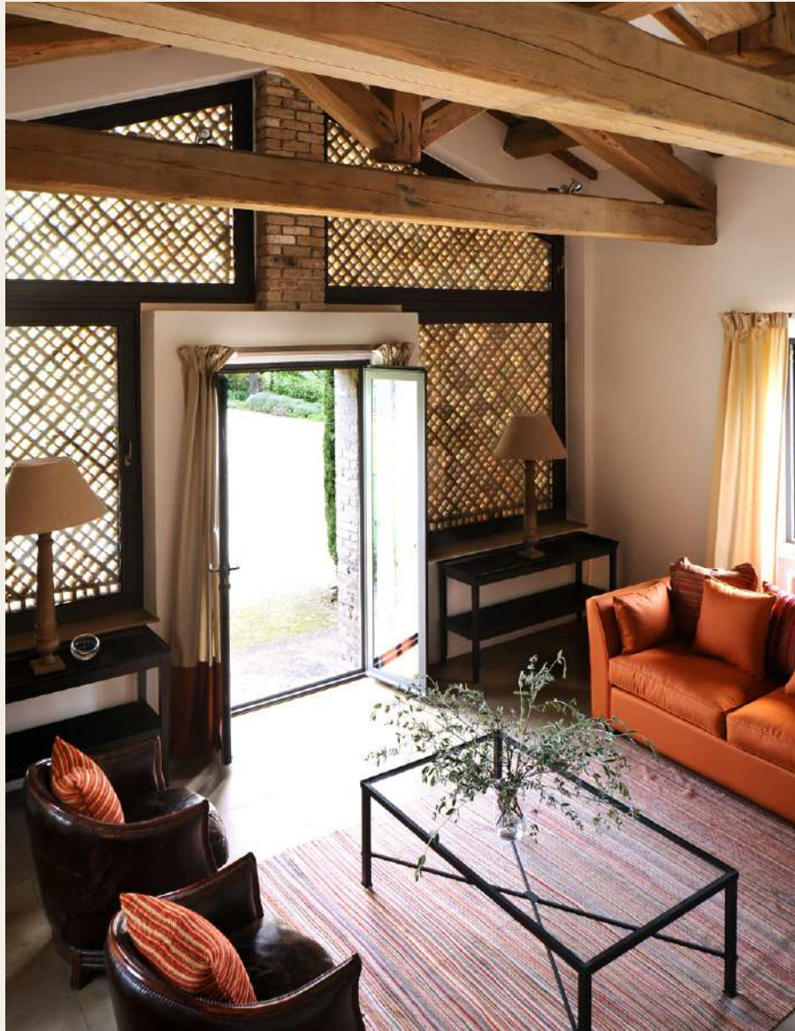
Dappled light filtering through the barn-like windows of the Guest House