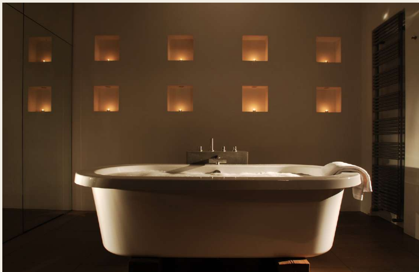
Master Suite Bathroom