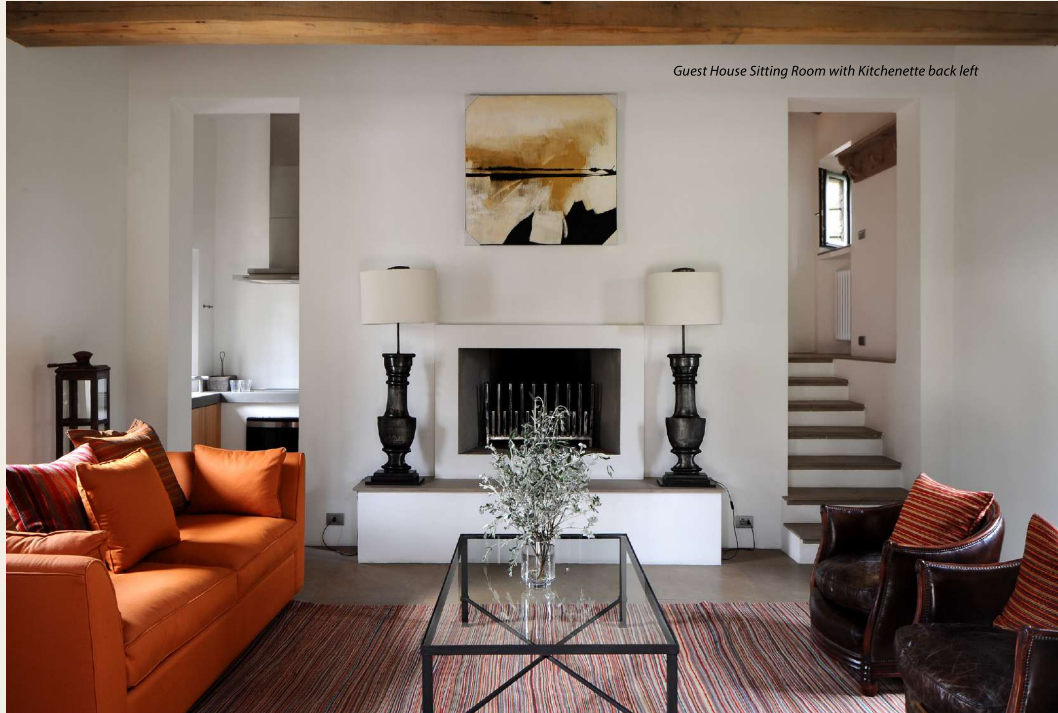
Guest House Sitting Room with Kitchenette back left