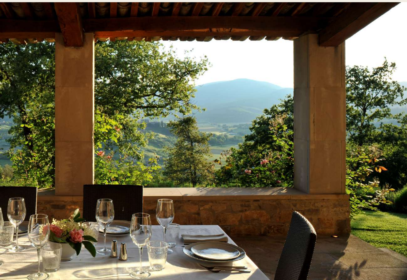
Angle of the covered outdoor Dining area