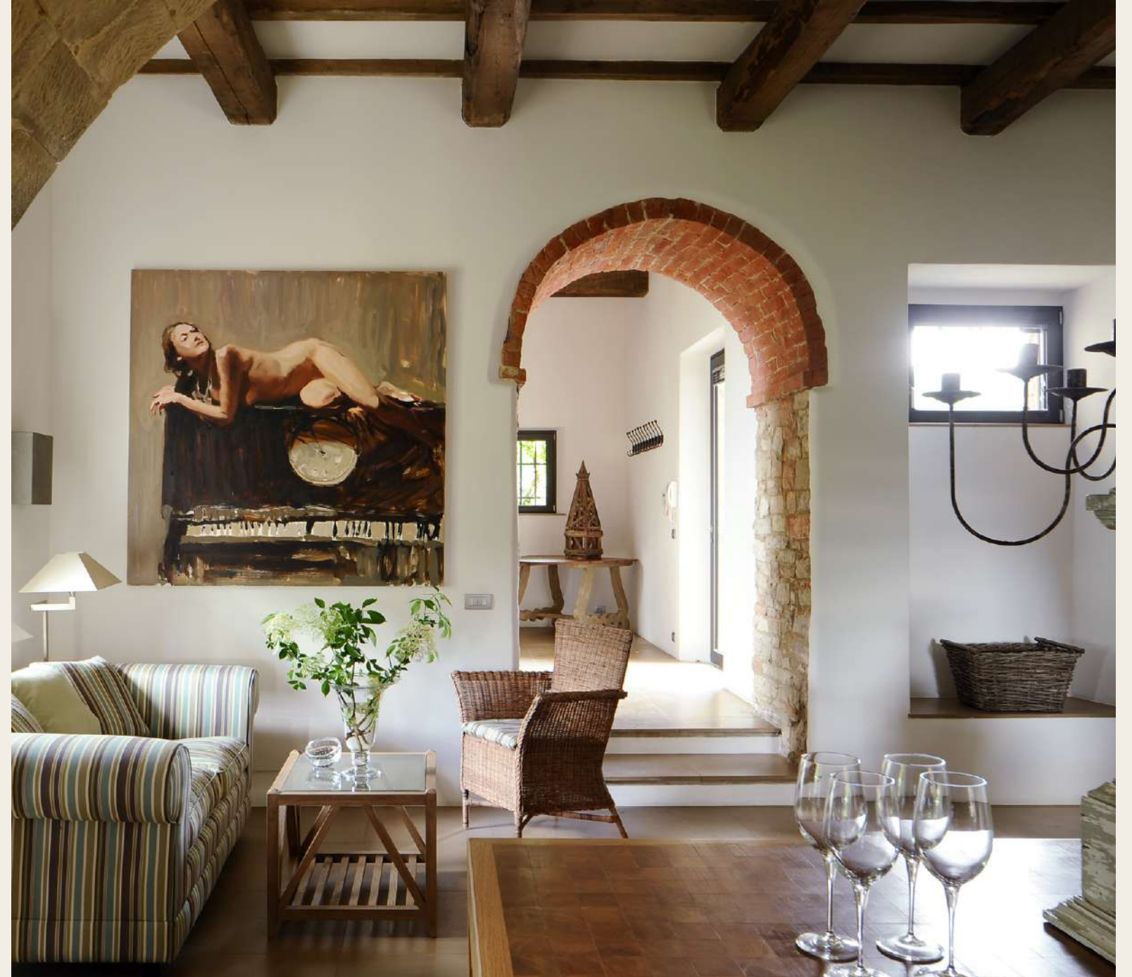
The leisure end of the kitchen