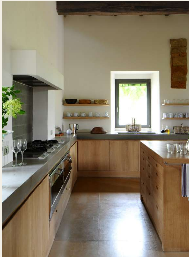
Sandstone and oak in the working end of the kitchen