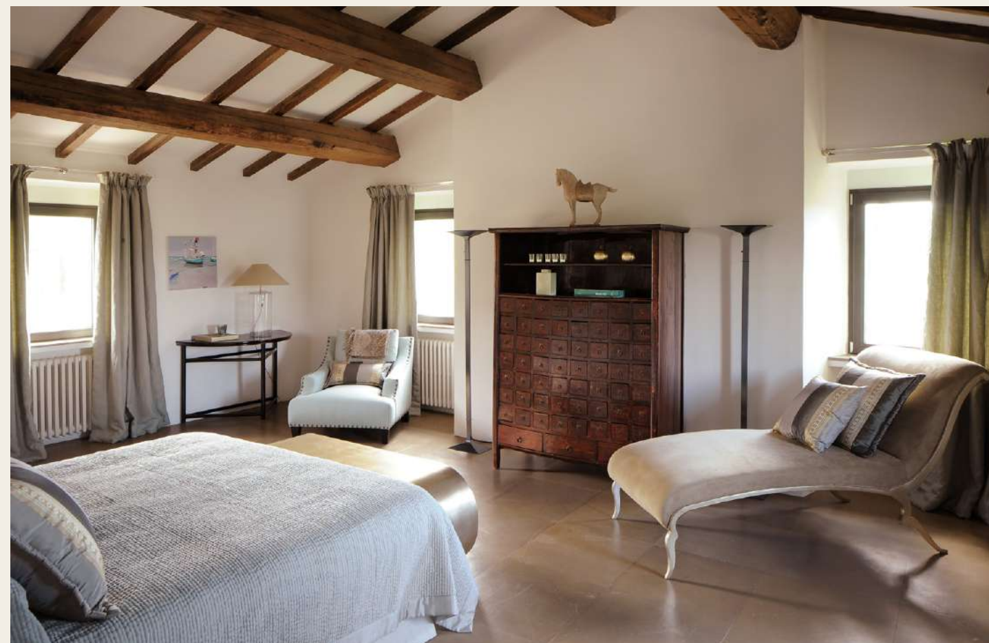
Master Bedroom with windows on three sides