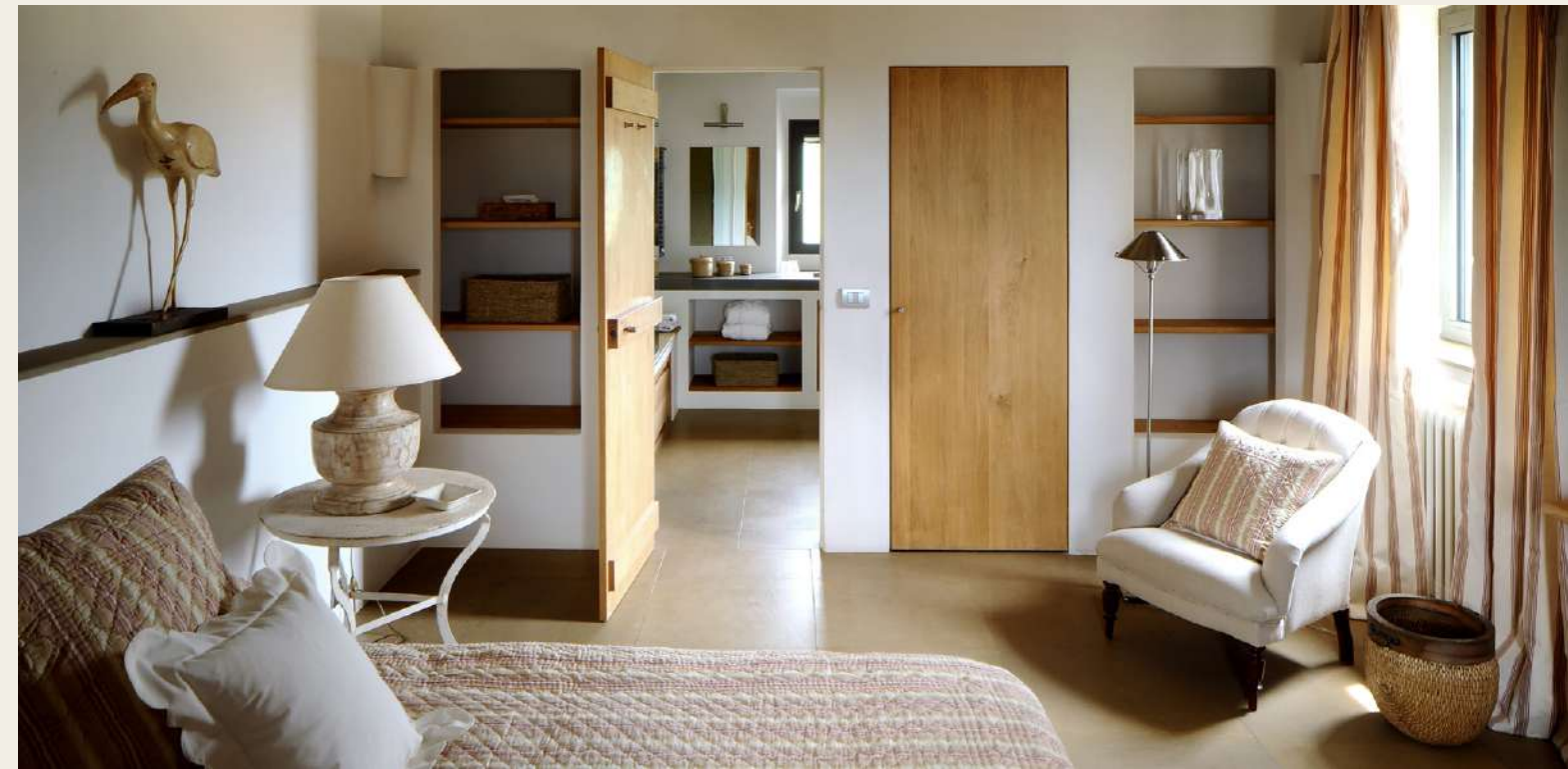
2nd Floor Bedroom and Bathroom