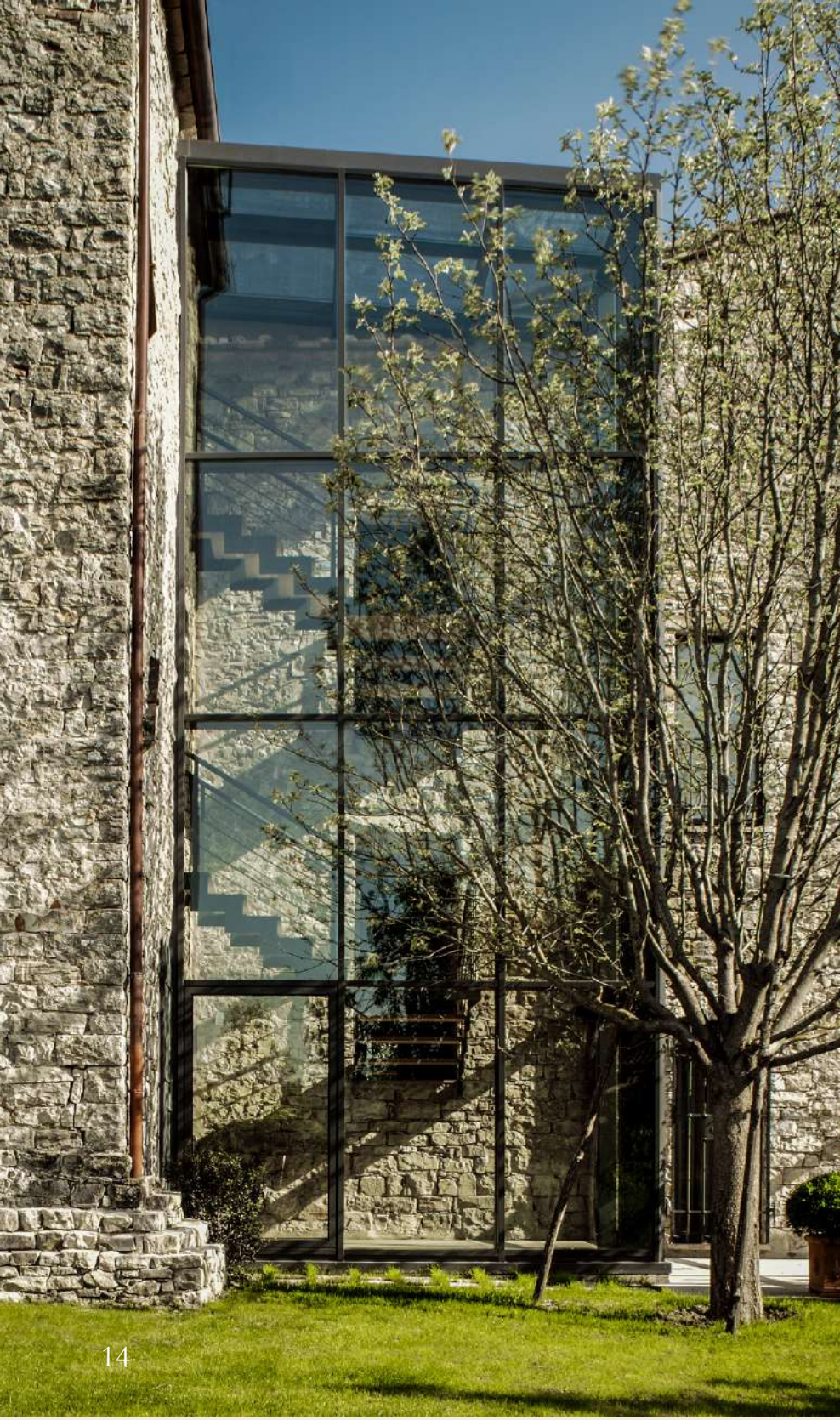
The glass tower houses the staircase