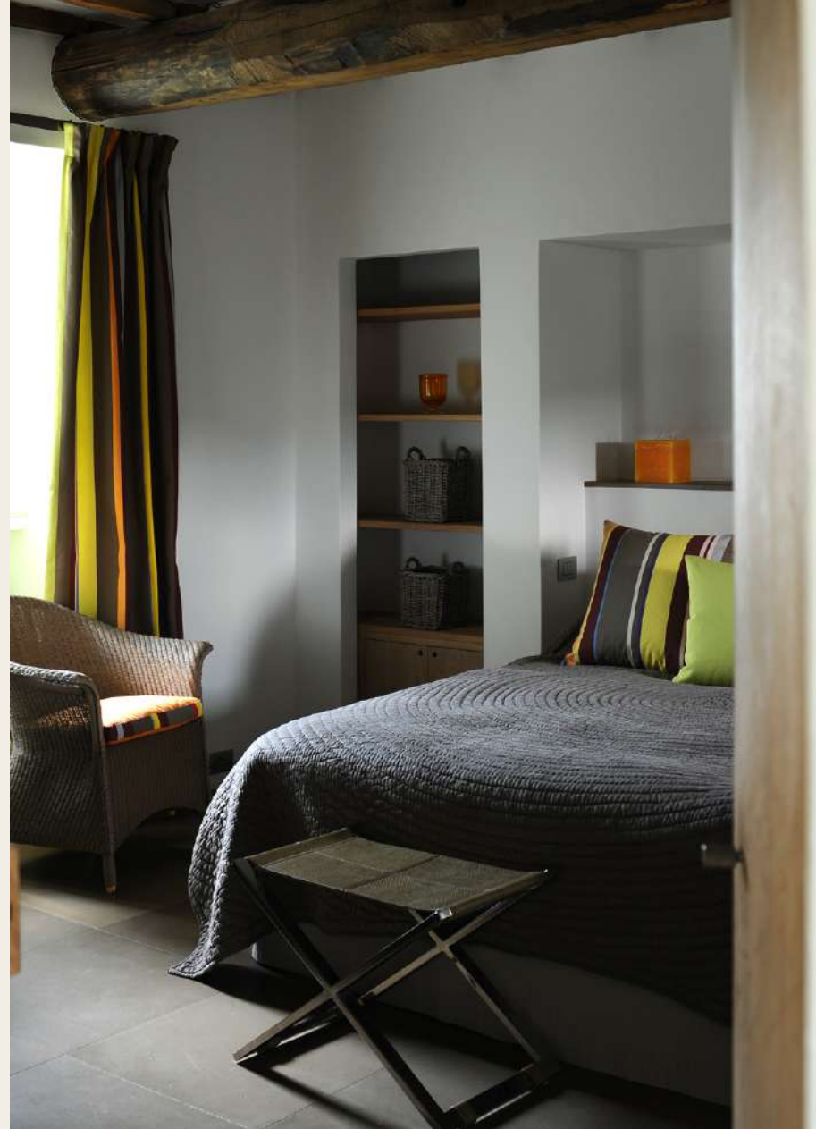
1st Floor Bathroom and Bedroom