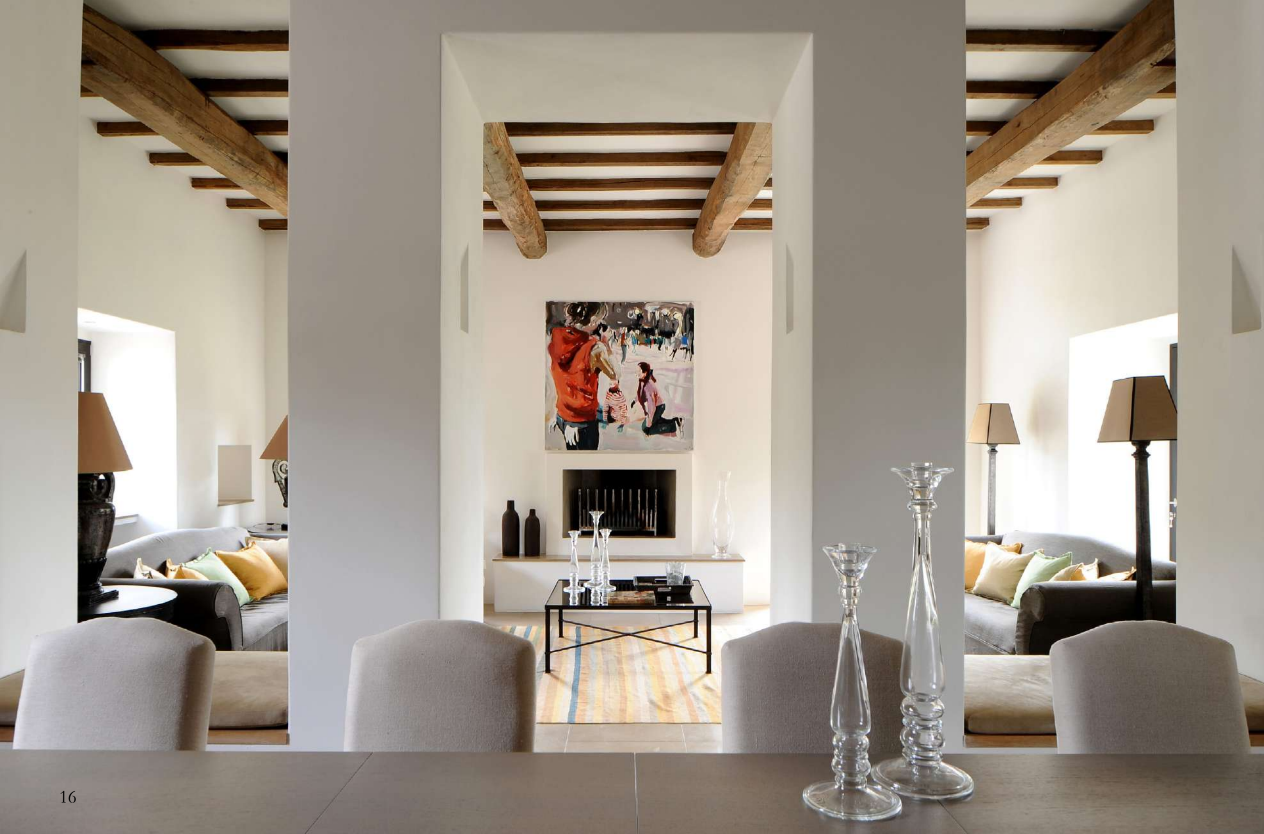
The Summer Sitting Room a step down from the Dining area