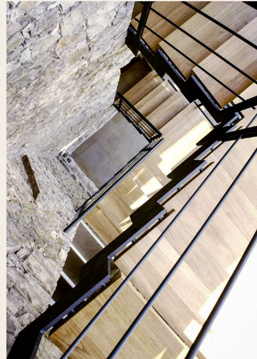
Steel frame with oak treads of the staircase hangs off the 11th century walls