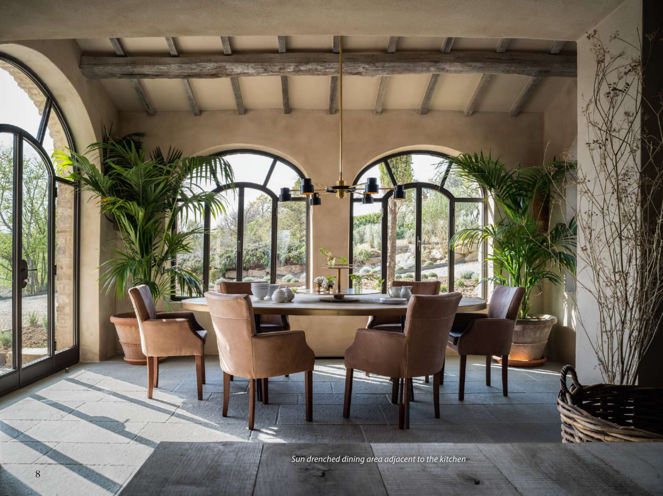
Sun drenched dining area adjacent to the kitchen