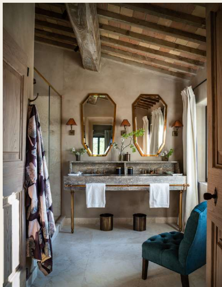
The bathtub within the master bedroom and ensuite shower room