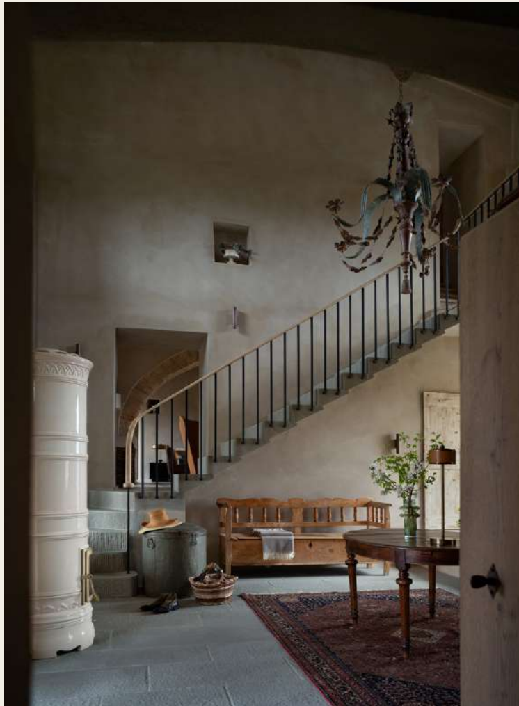
Approach to the hall from a guest bedroom