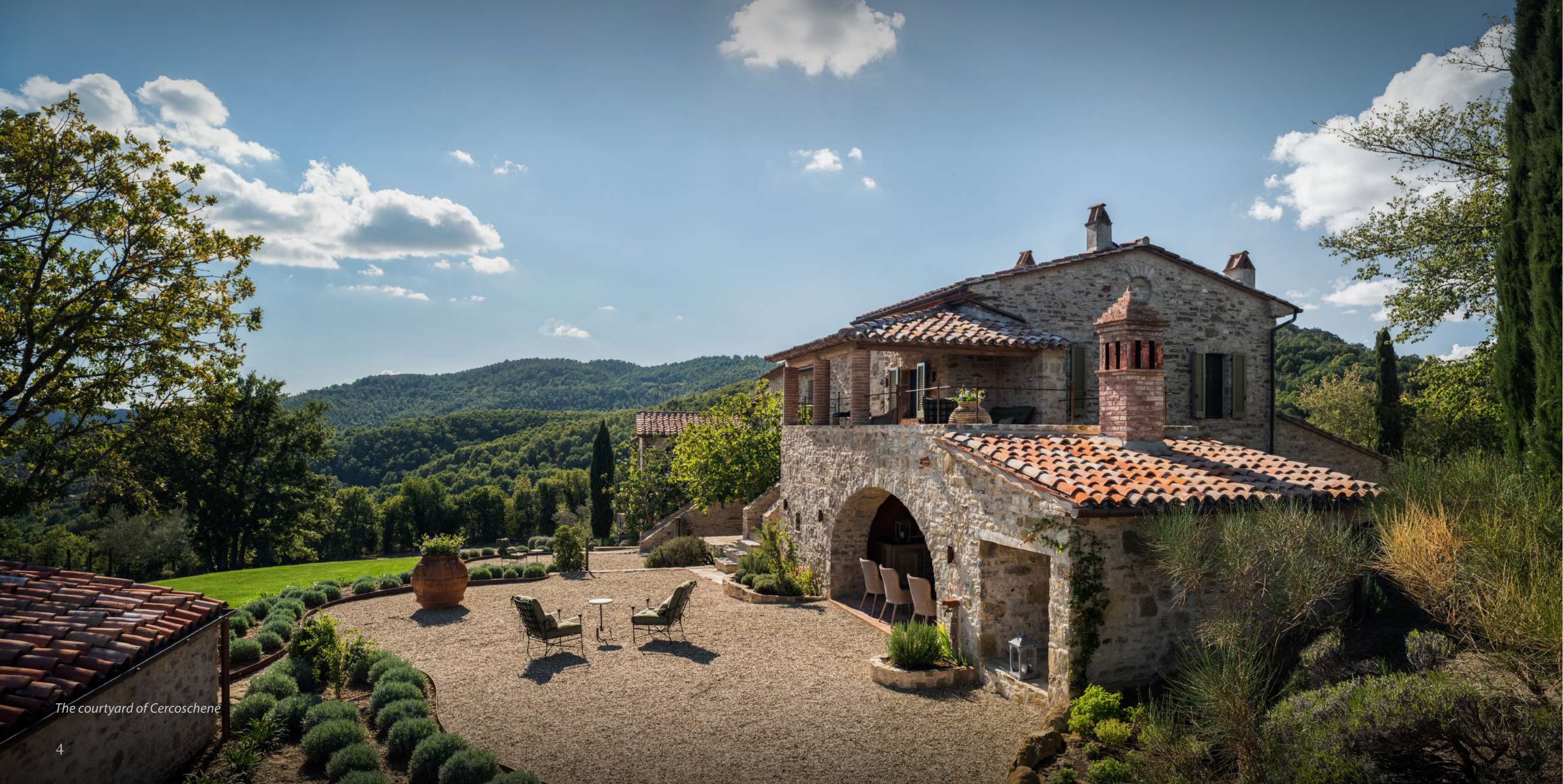
The courtyard of Cercoschené