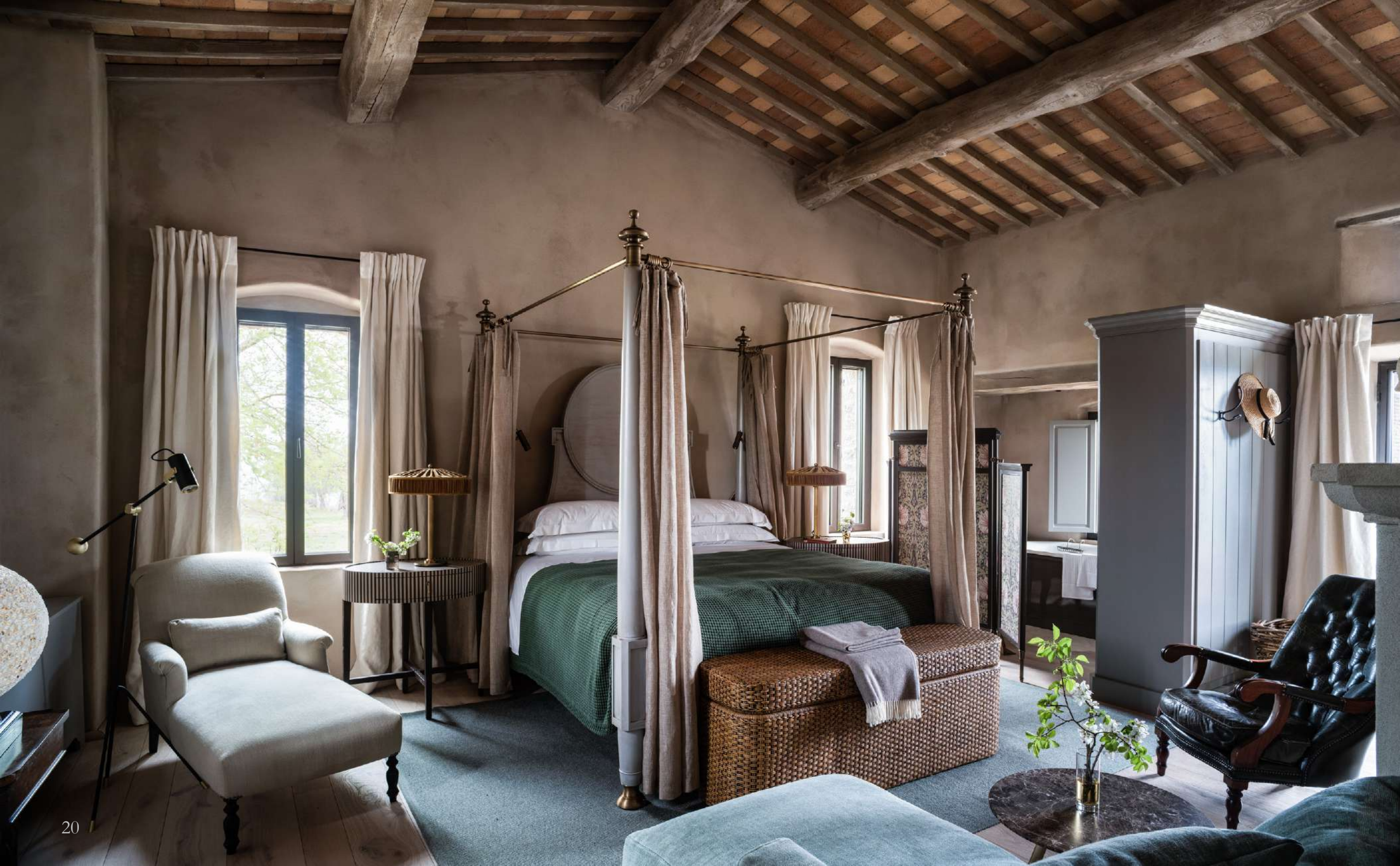
The master bedroom