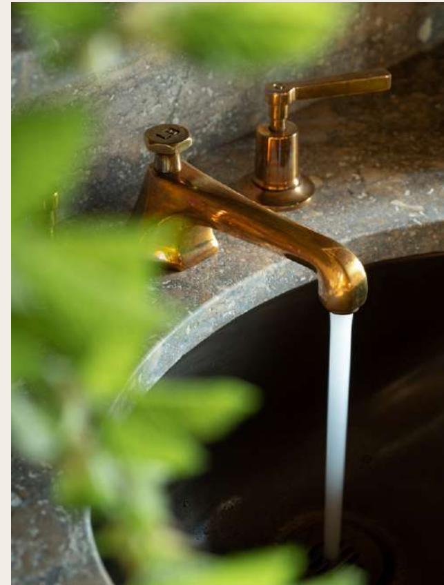
The bathroom in the independent studio