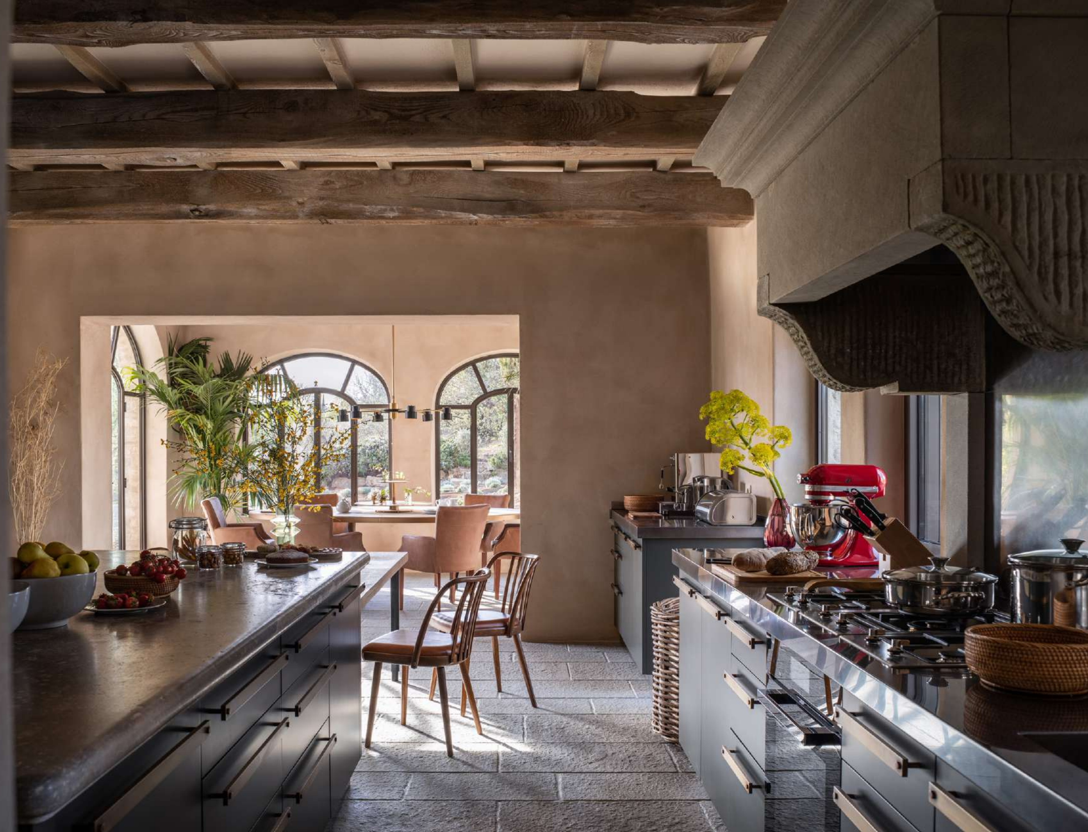
The kitchen with a view to the dining area