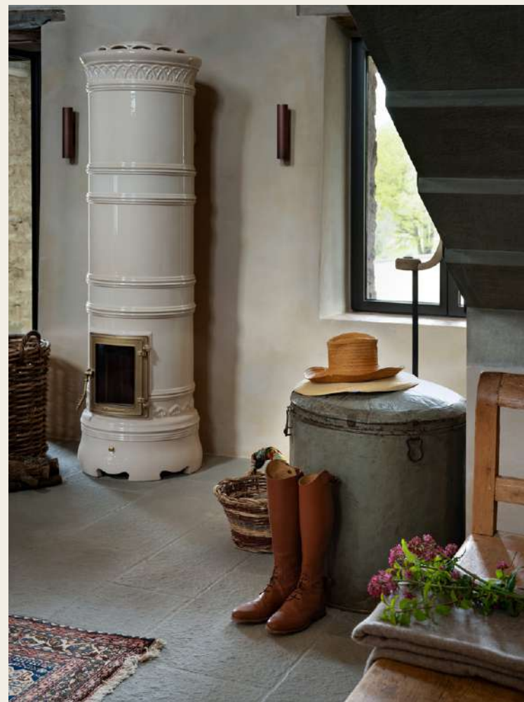
The light filled hall and wood stove detail