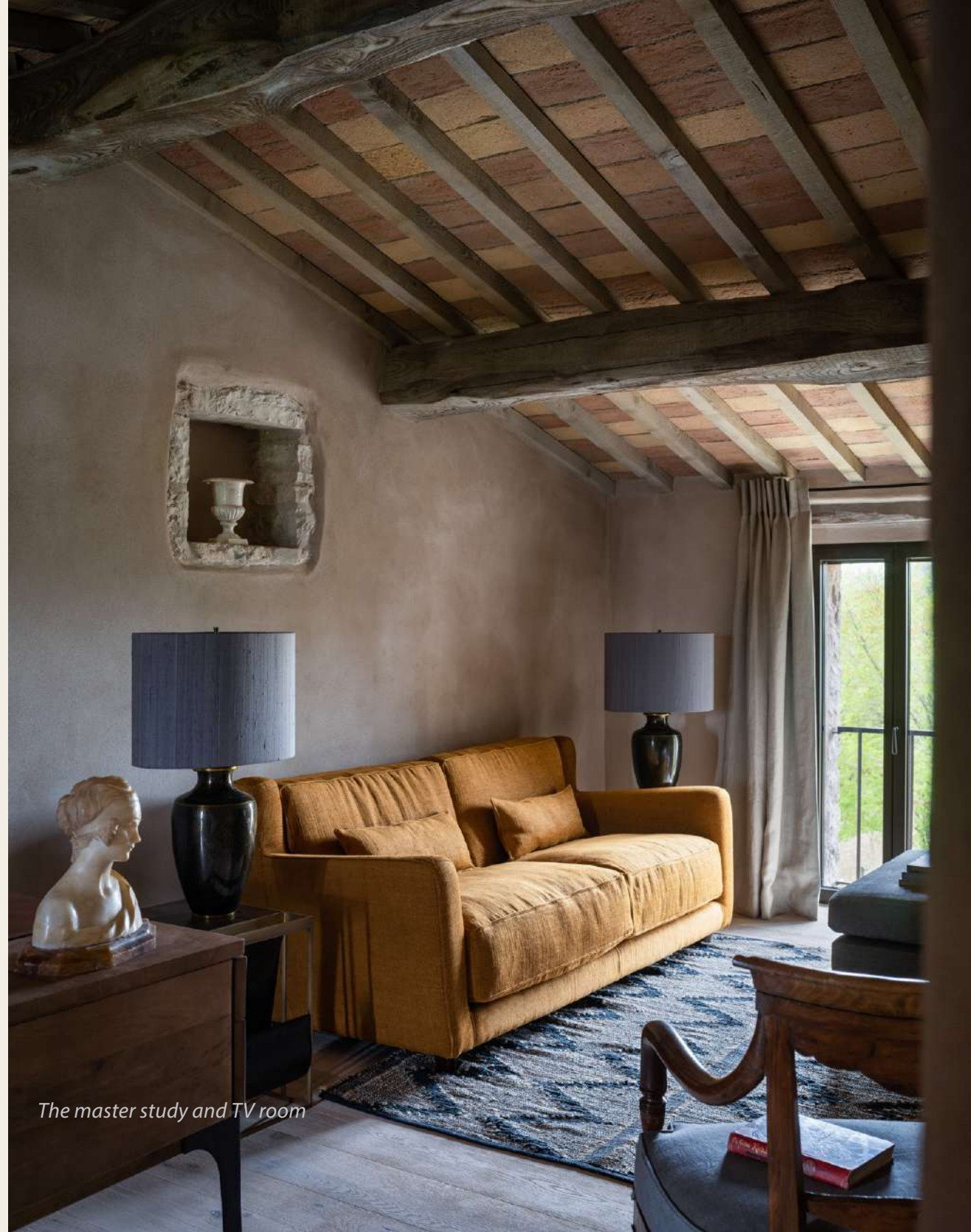
The master study and TV room