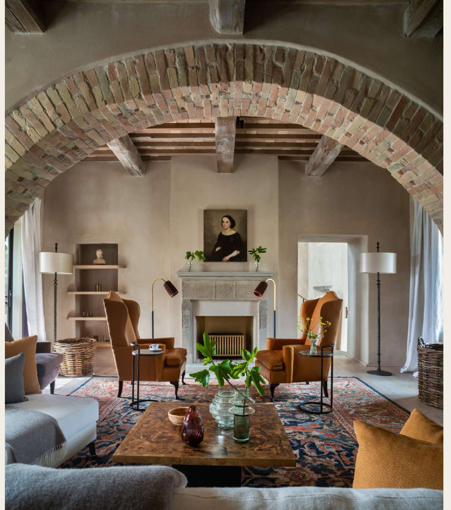
The Sitting Room