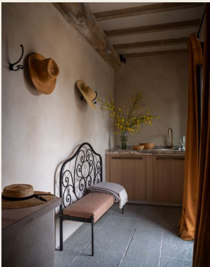
Entrance and bedroom in the independent studio