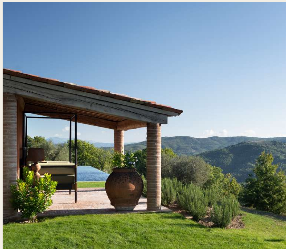
Panoramic swimming pool