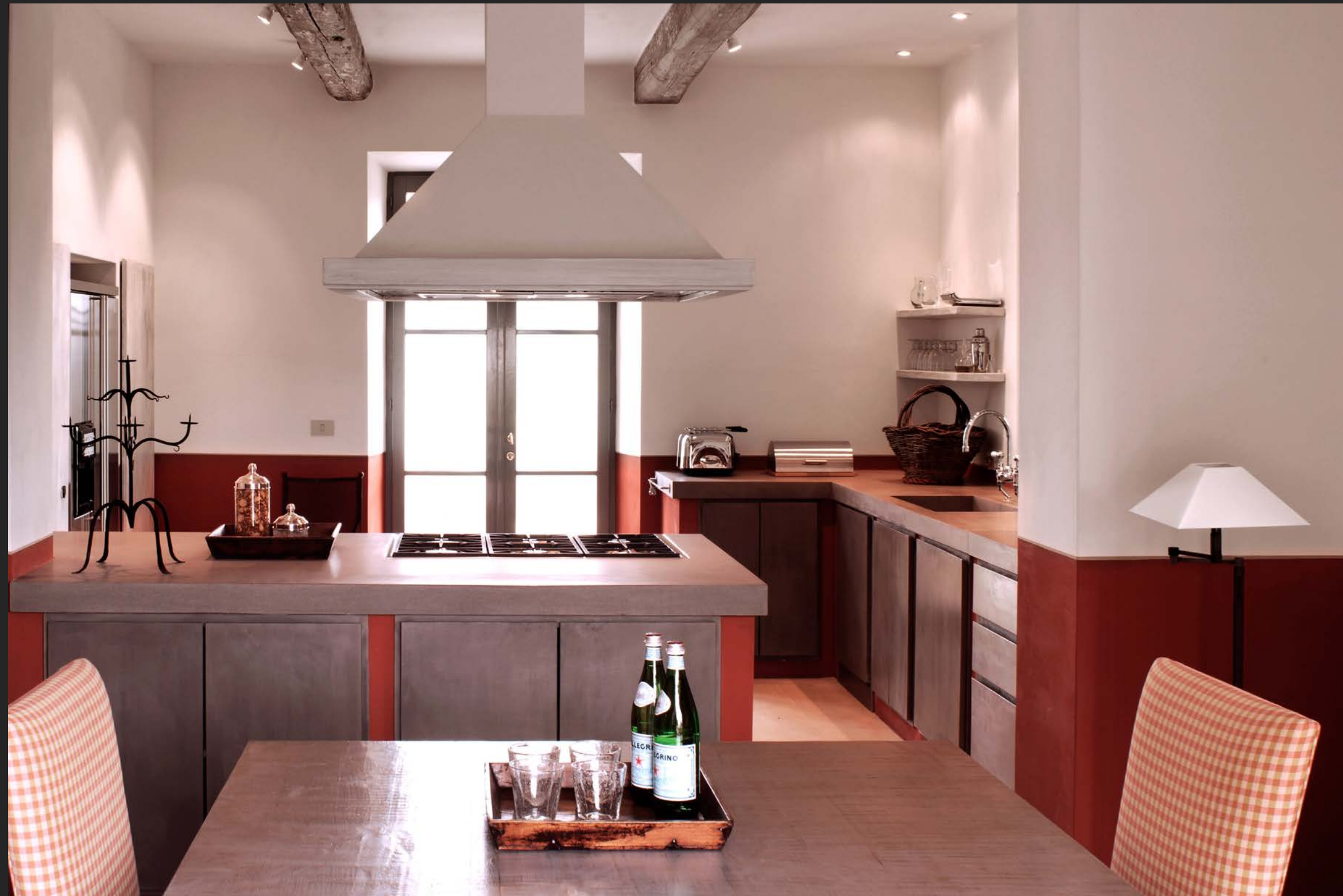
Fully equipped Kitchen leads to Sitting Room, Dining Terrace, Dining Room and Courtyard