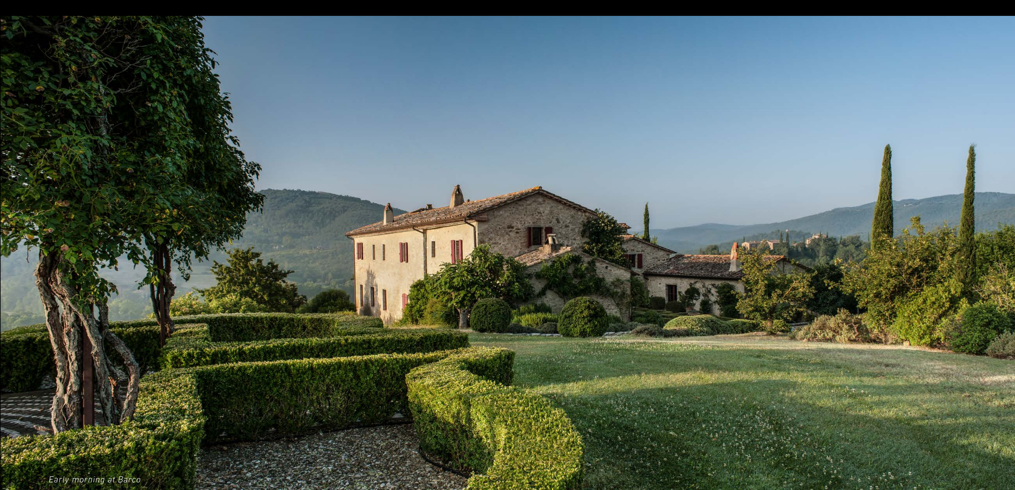
Early morning at Barco