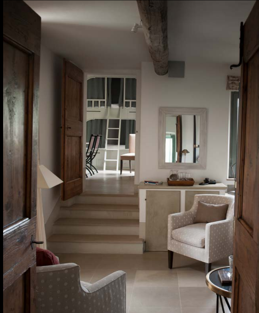
Ground floor Bedroom