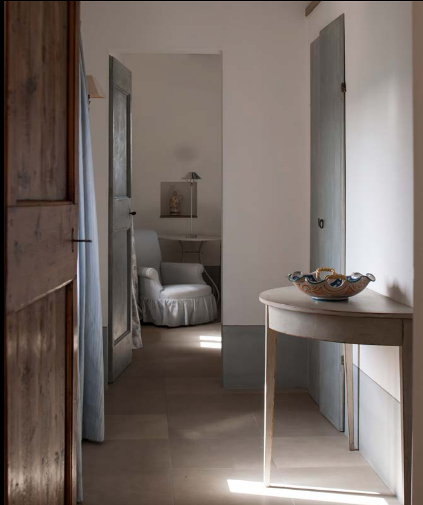
Leading to Guest Bedroom Guest Bedroom on first floor with en-suite Bathroom