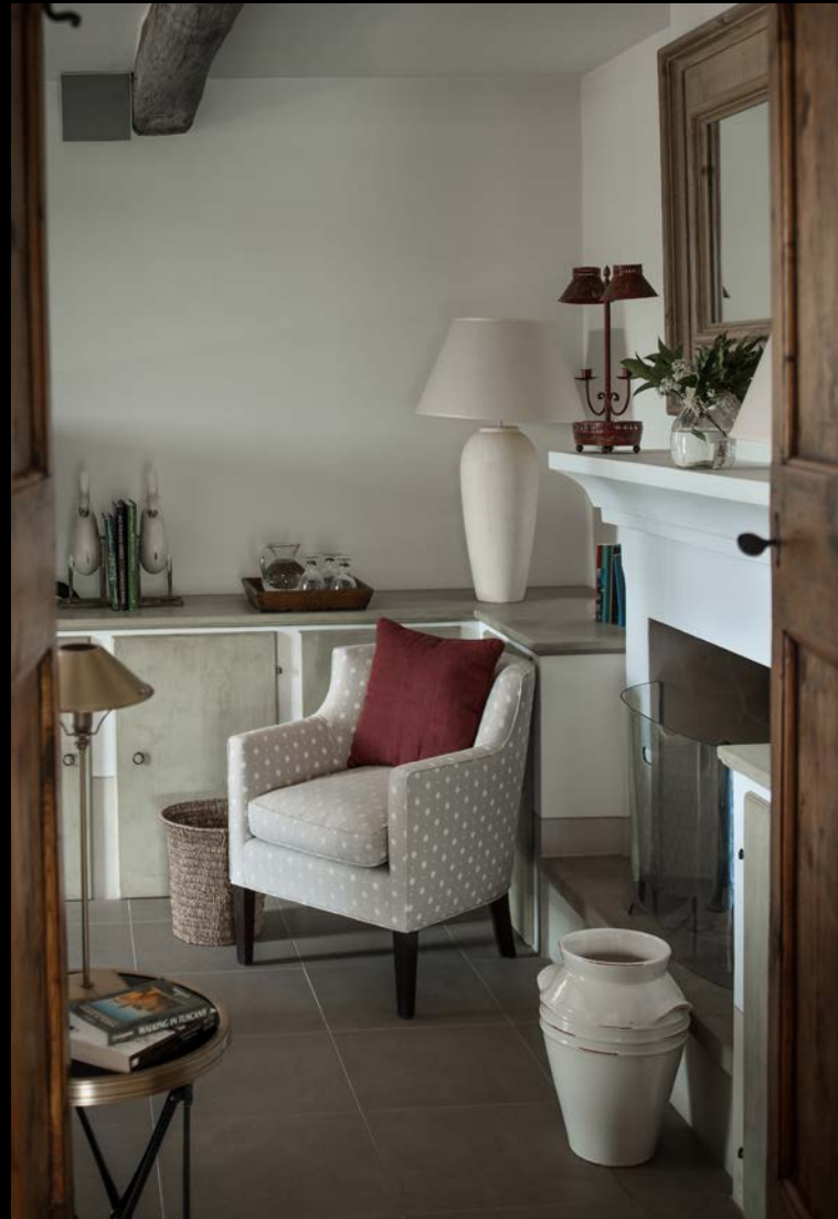
Corner of Guest Bedroom

Guest Bedroom on the ground floor, with ensuite Shower Room