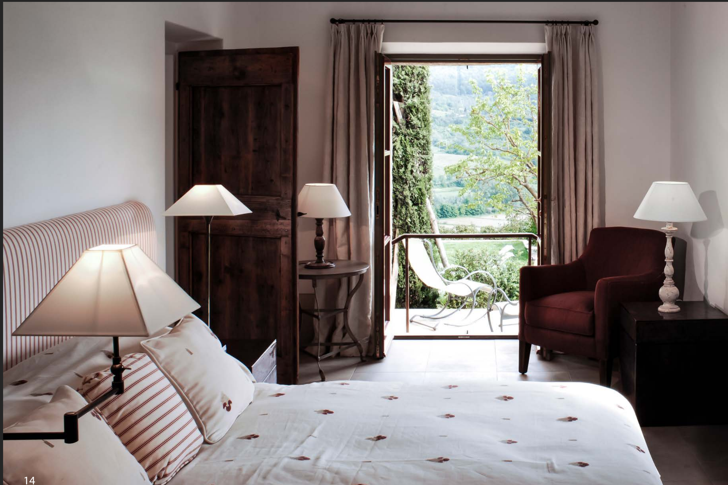
Ground floor Bedroom with small Terrace