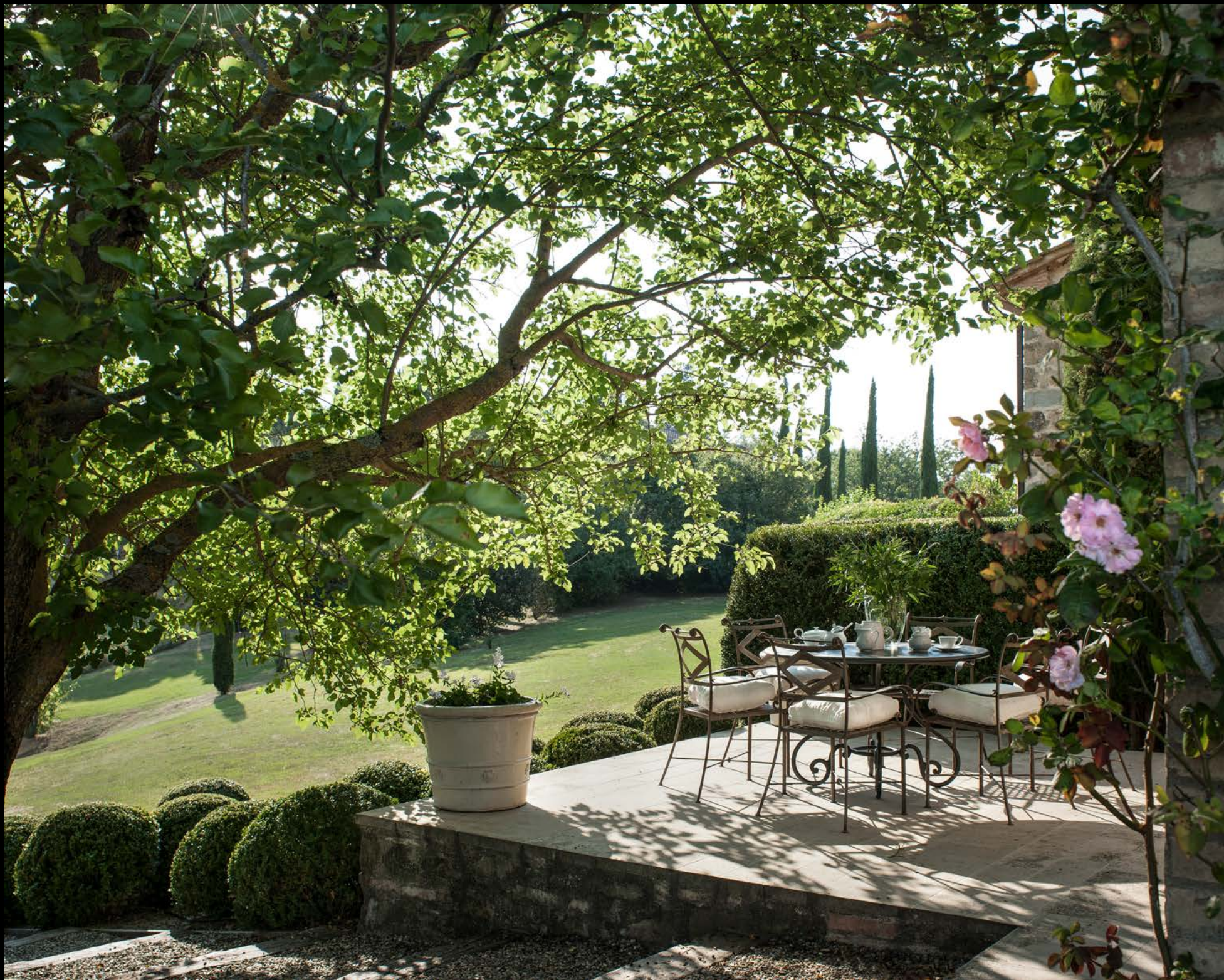
A shaded Terrace