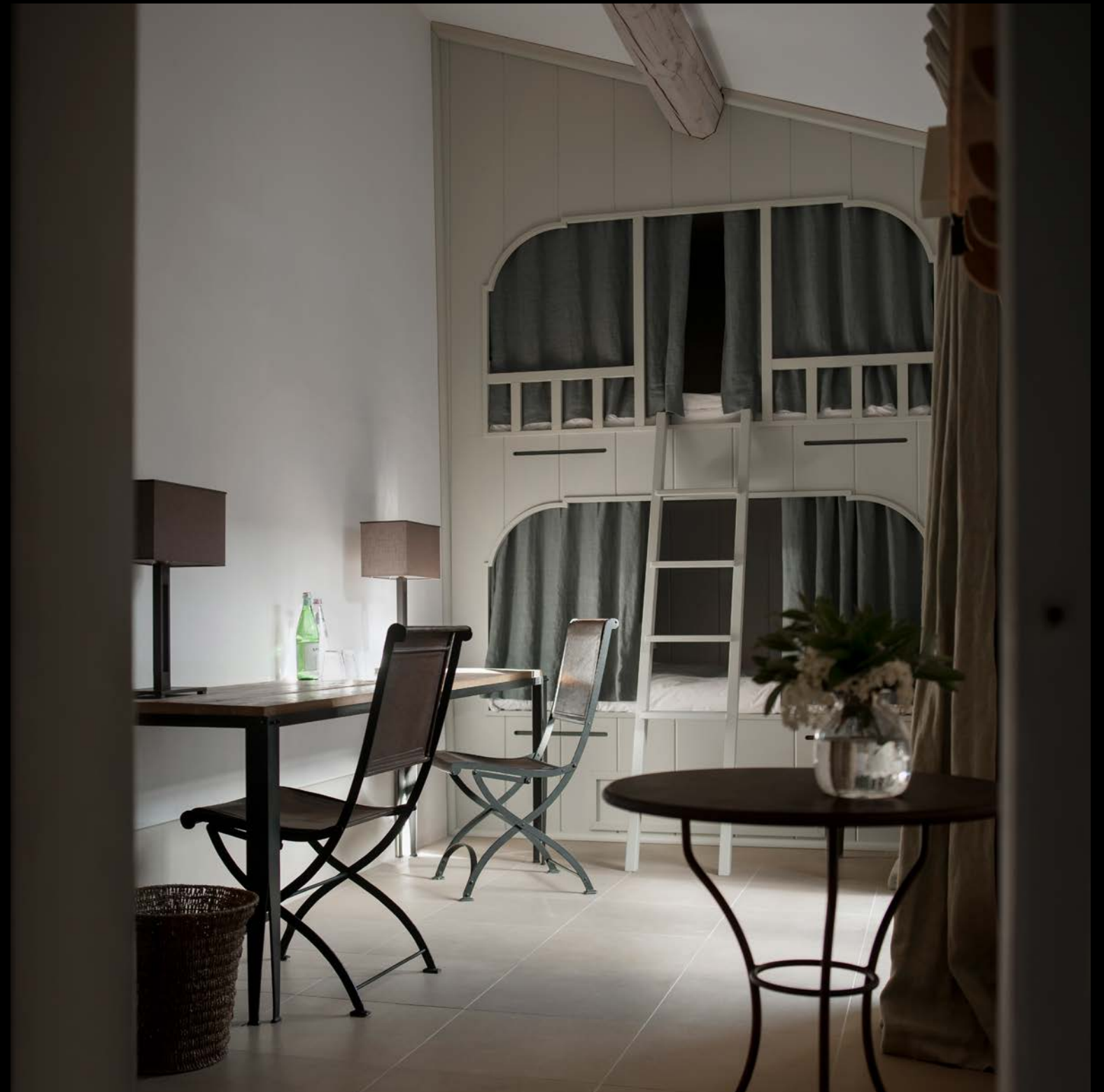
Bunk Beds sharing bathroom with ground floor bedroom