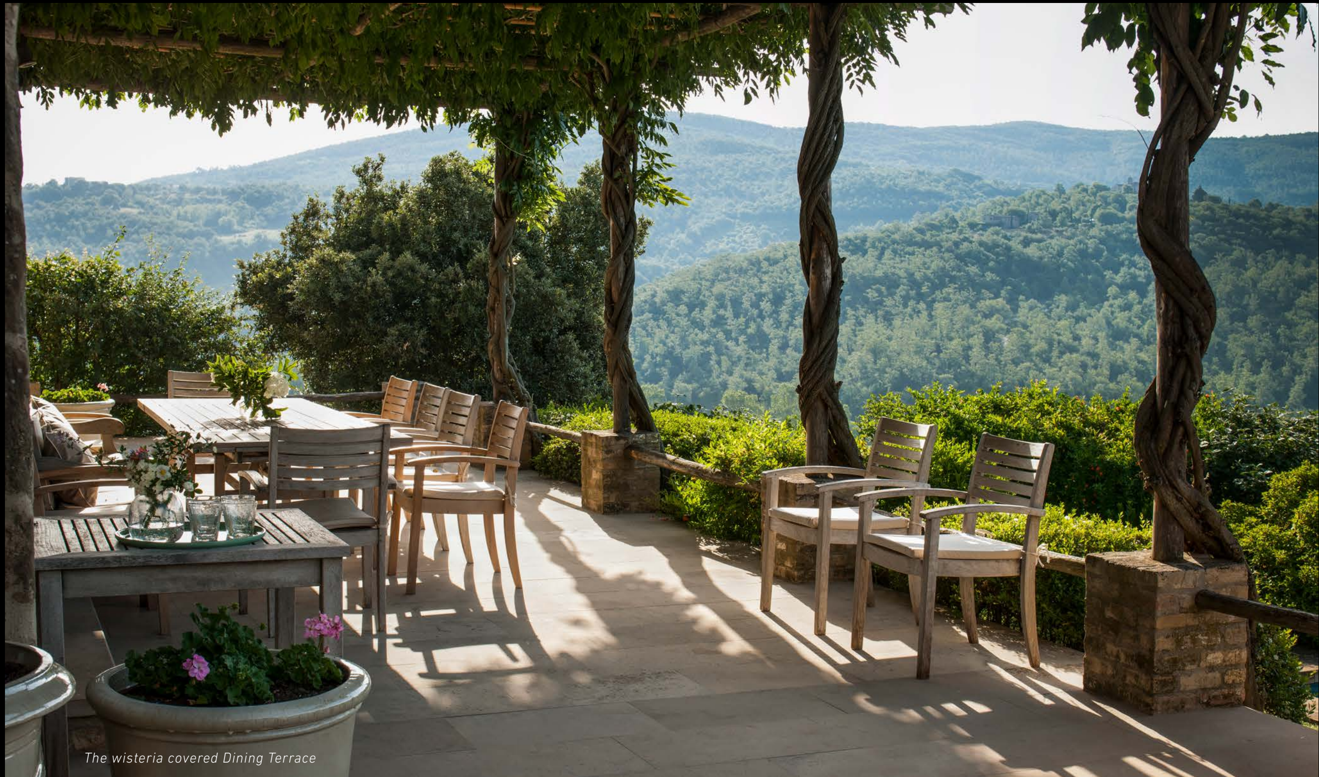
The wisteria covered Dining Terrace