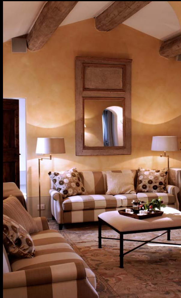
Master Sitting Room