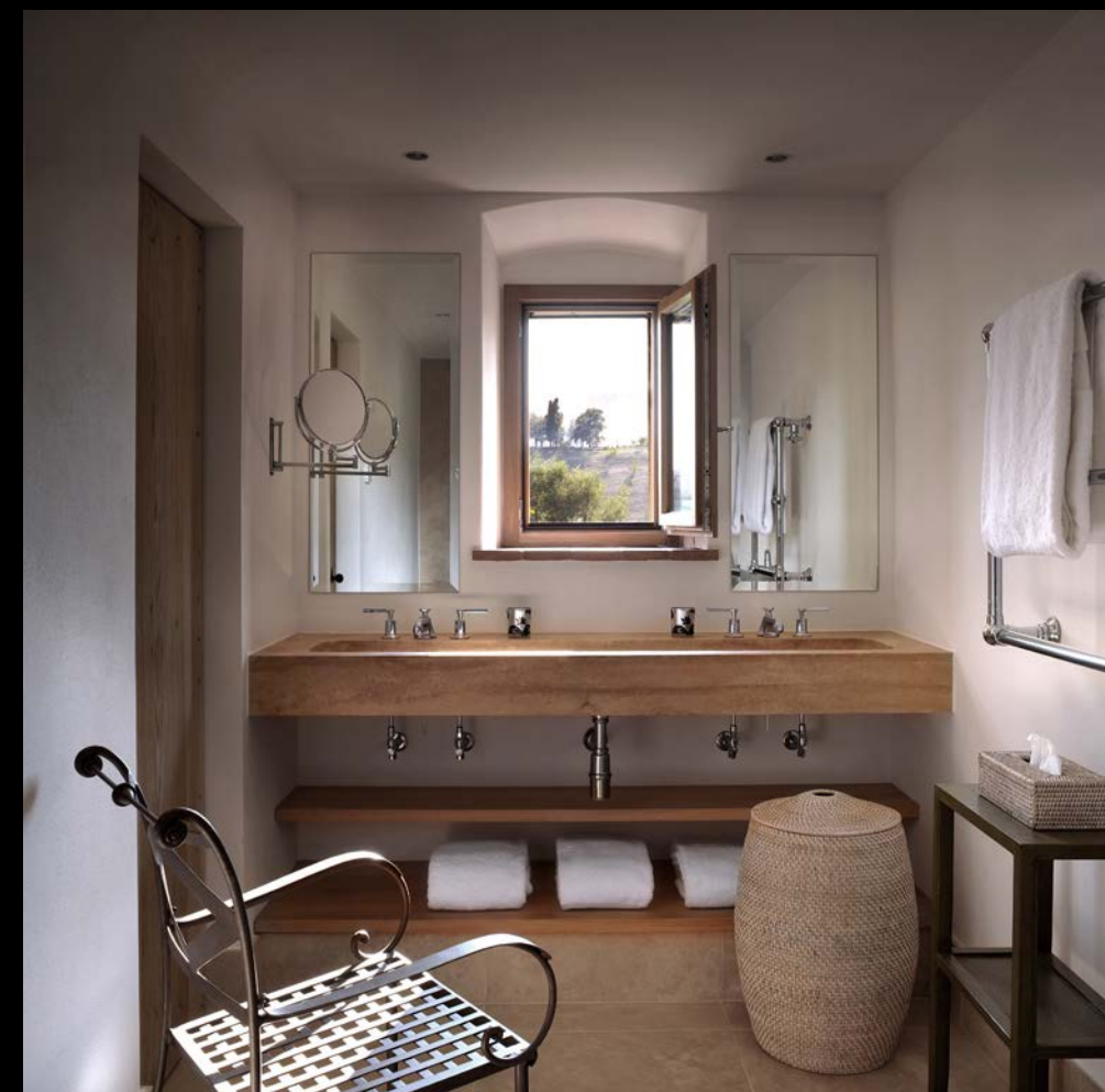
The open plan ground floor apartment Large Shower room