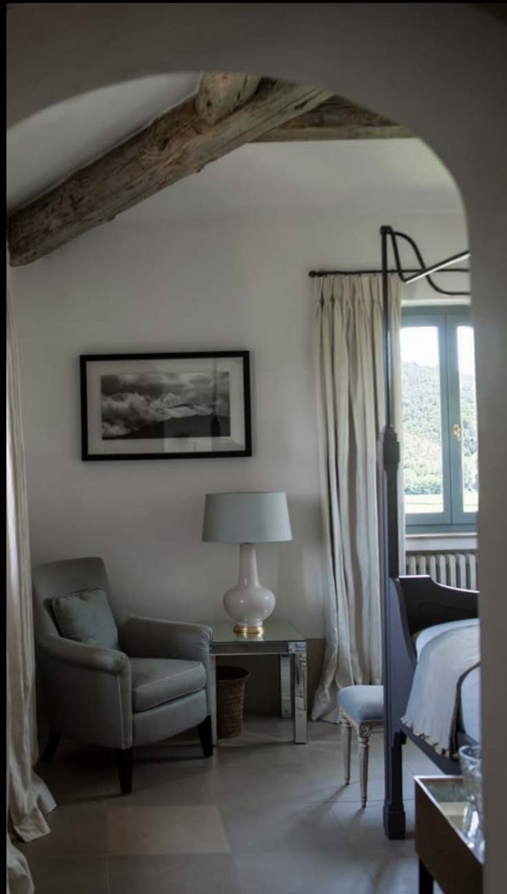
Angle of Master Bedroom