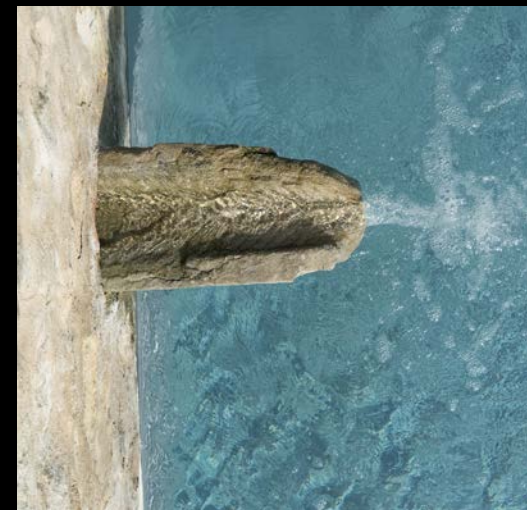
Furnishing and garden details including items from the B.B. for Reschio range