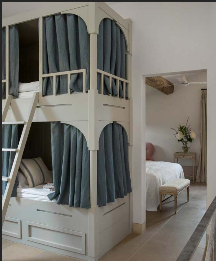
First floor Bunk Beds sharing shower room with Double Bedroom beyond