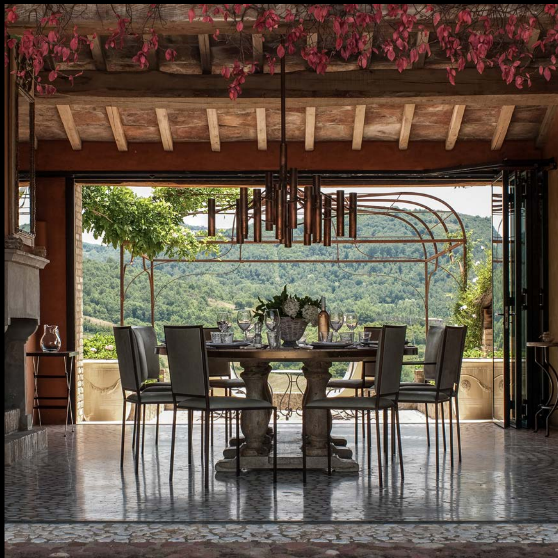
The wonderful indoor outdoor dining room space