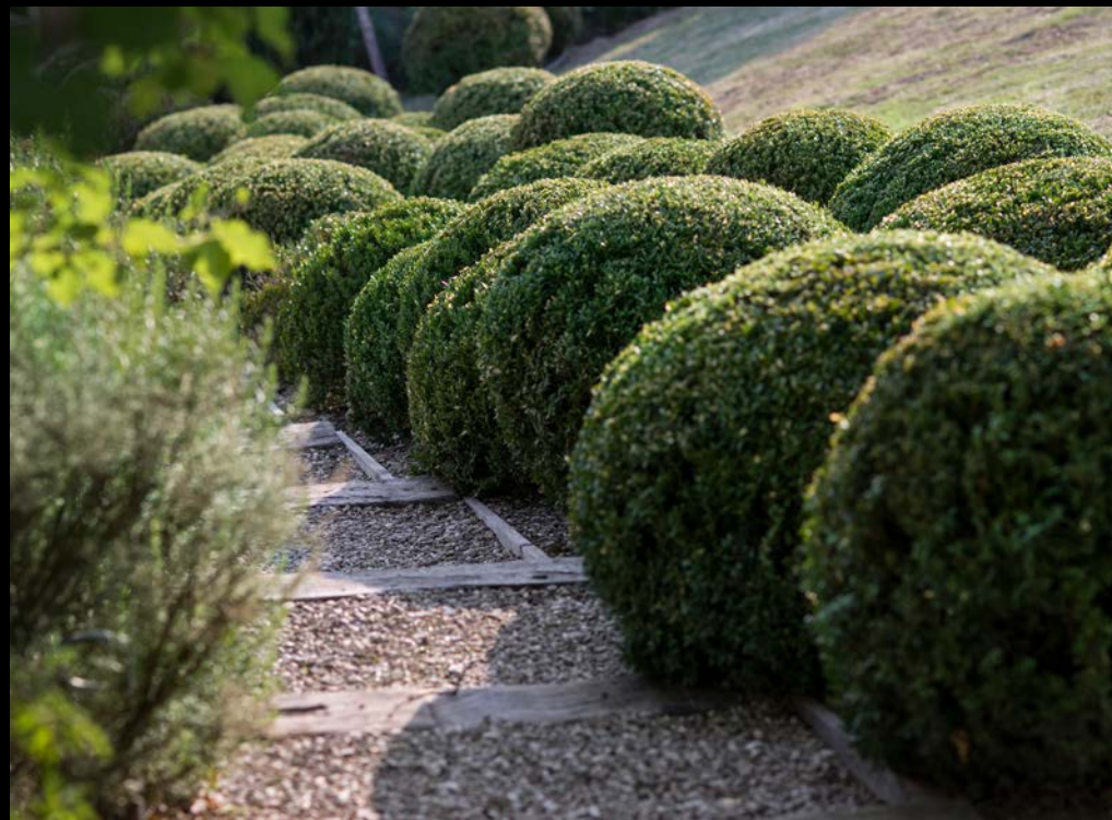
Barcolino garden details - box, cypress and lavender