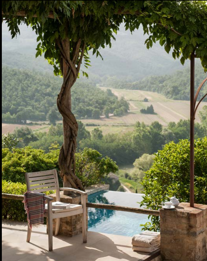
From the terrace to the pool to the view The 18 m x 4.5 m infinity swimming pool