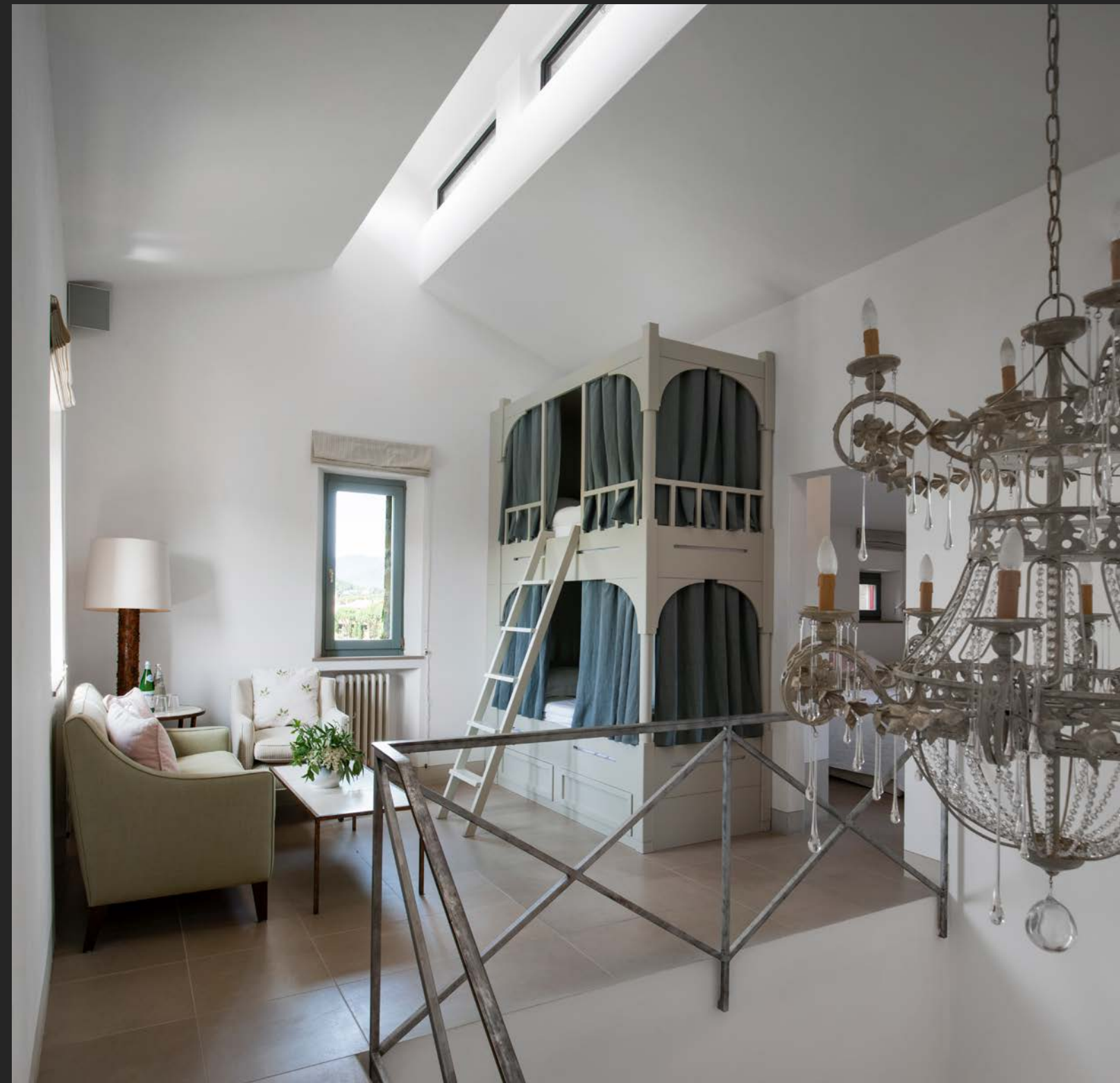
Bunk Bed mezzanine