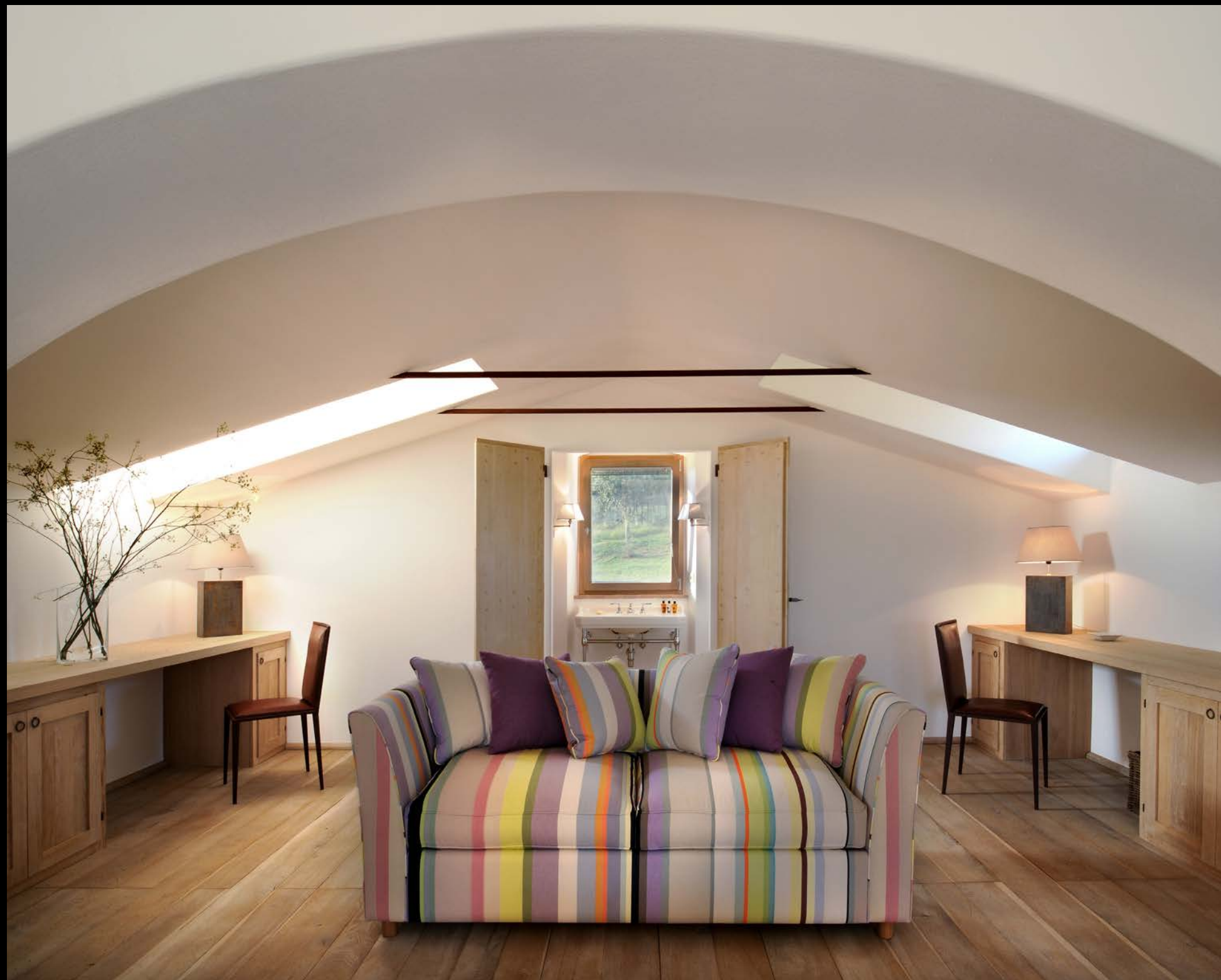
Barcolino mezzanine floor with sofa bed and shower room beyond