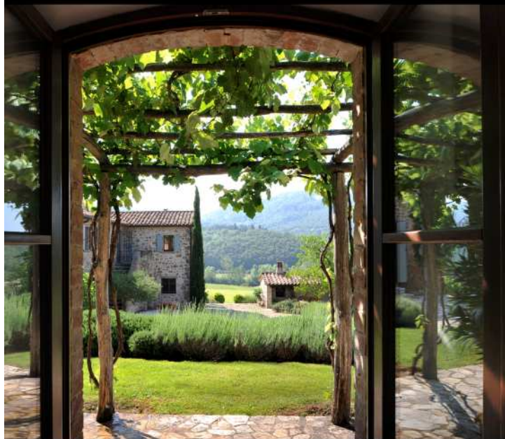
Page 19 – View from the Guest Annex