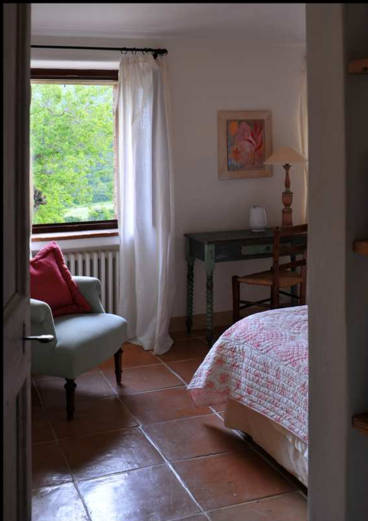
Page 16 - Spacious Double Bedroom with access to the garden and Guest Annex