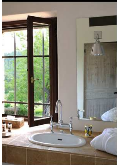
Page 15 - Detail of Shower Room en-suite to spacious Double Bedroom