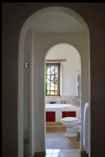
Page 10 - One half of the Sitting Room with French limestone fireplace