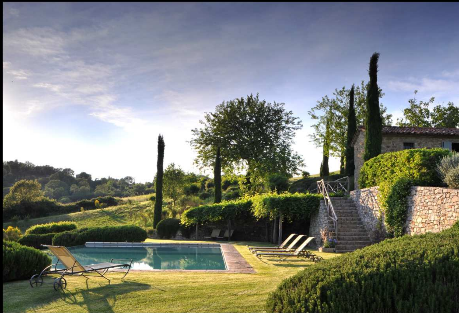
Page 20 – Perfectly placed pool