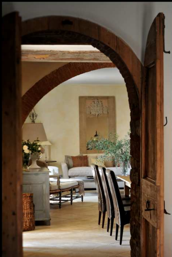
Page 7 - Step up from the kitchen to the Dining area and Sitting Room