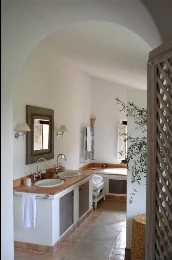
Page 13 – En-suite Bathroom & shower