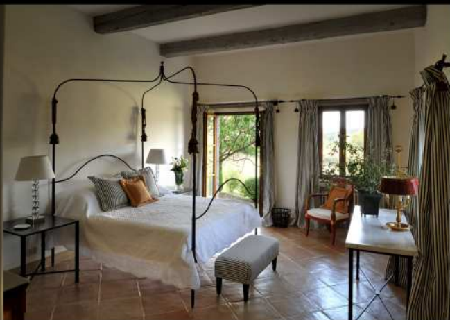
Ground floor double Bedroom with access to the garden and en-suite Bathroom with separate shower