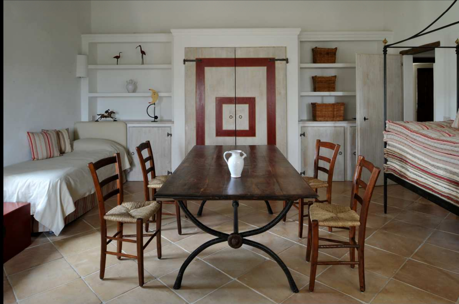
Page 14 – Adaptable spacious Twin Bedroom