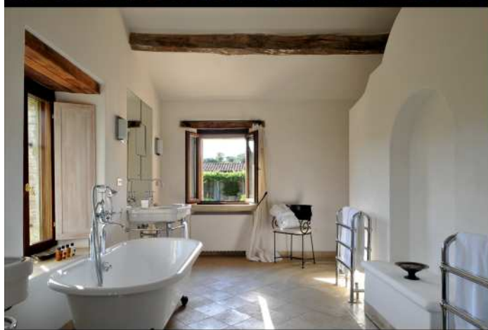
Master Suite - Bedroom with ensuite Bathroom & shower, Dressing & private Terrace