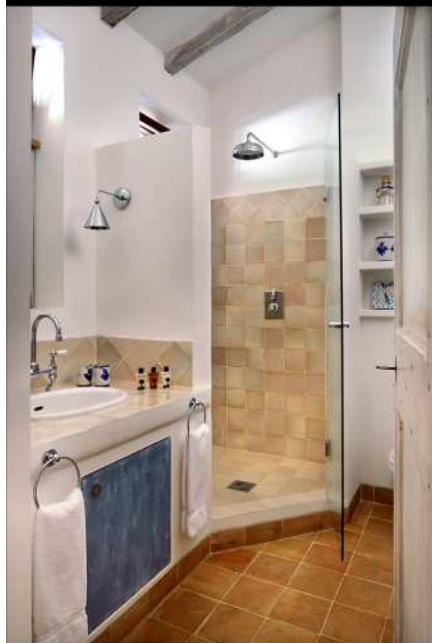
Page 21 – En-suite Shower Room & Double Bedroom in the Guest Annex