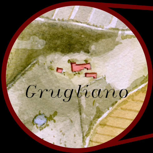
Castello di Reschio Estate map