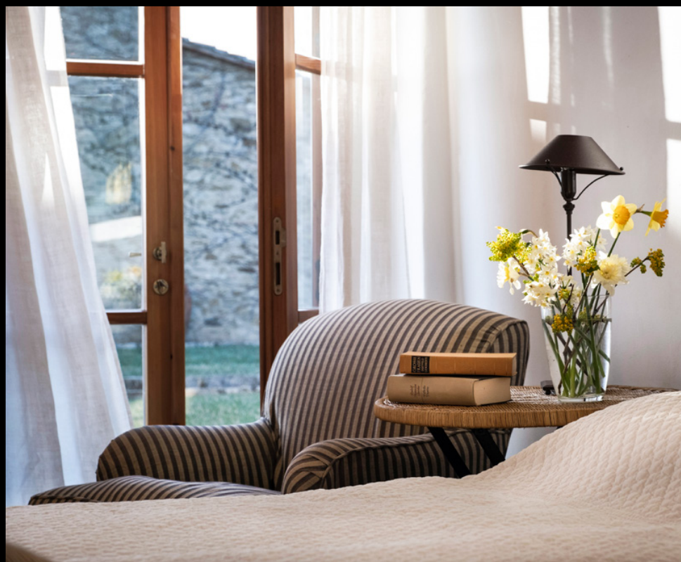
Ground floor Bedroom and detail