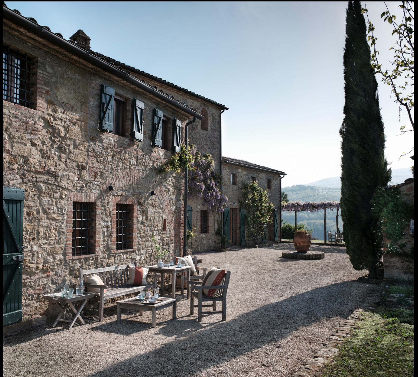
Courtyard beside the main house