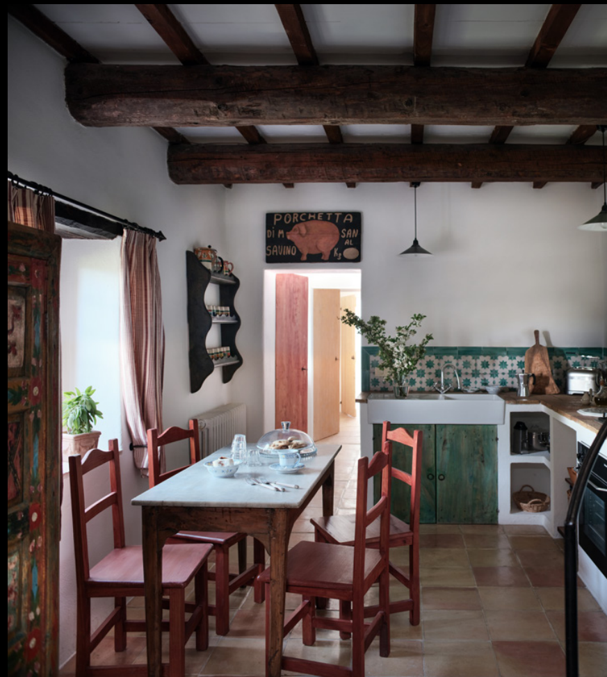
Gate house Kitchen-Dining room