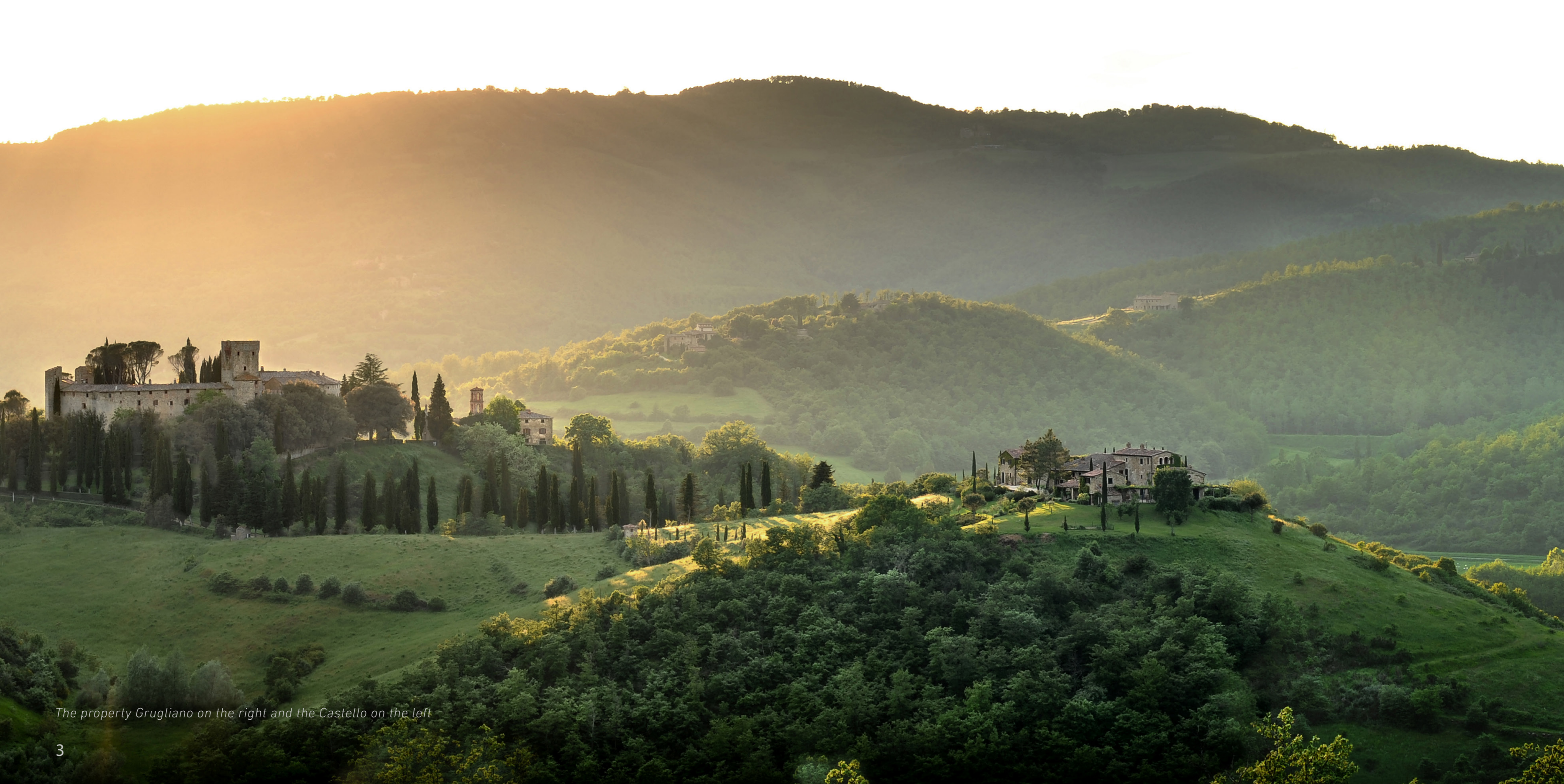
The property Grugliano on the right and the Castello on the left