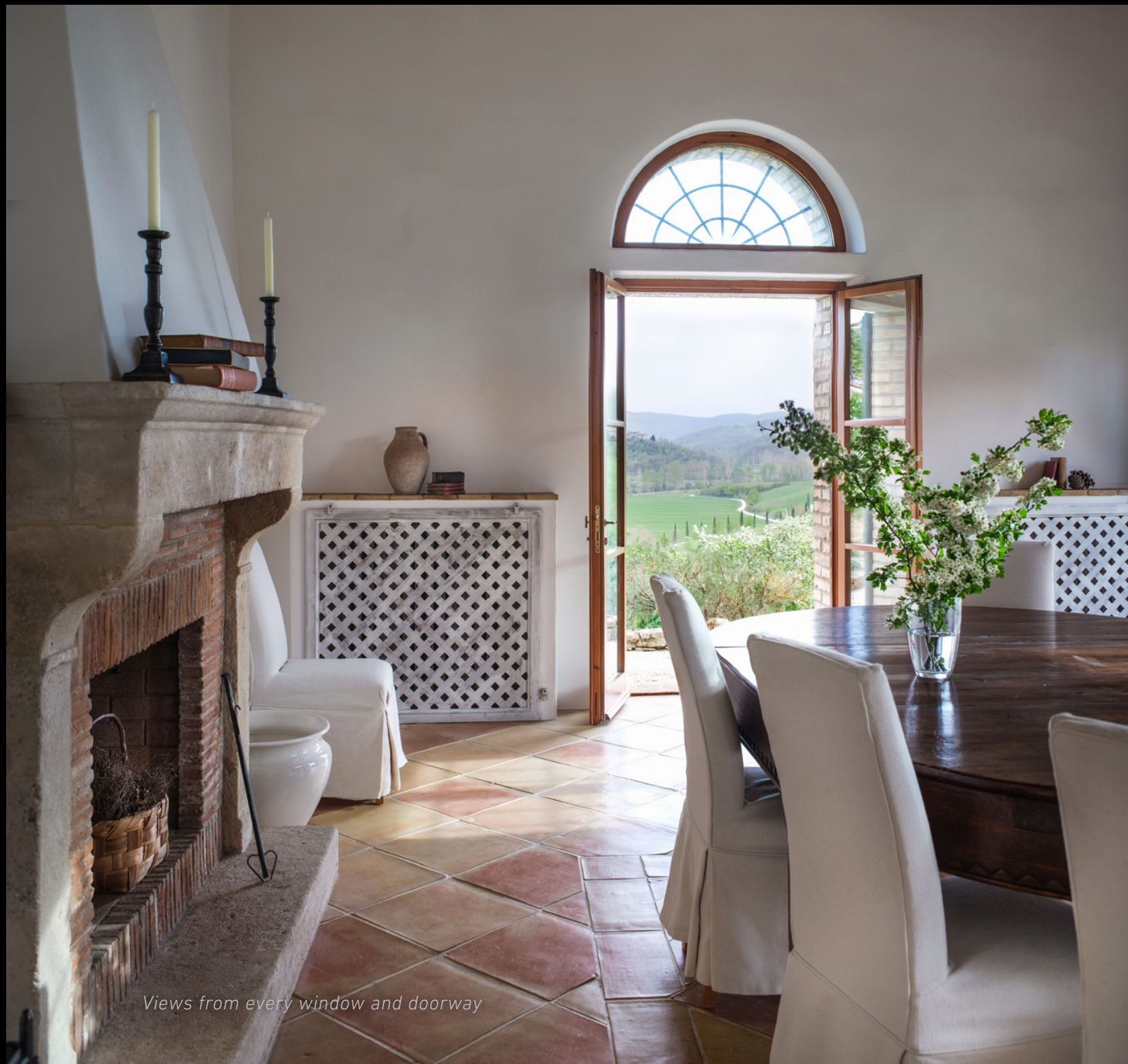
Views from every window and doorway