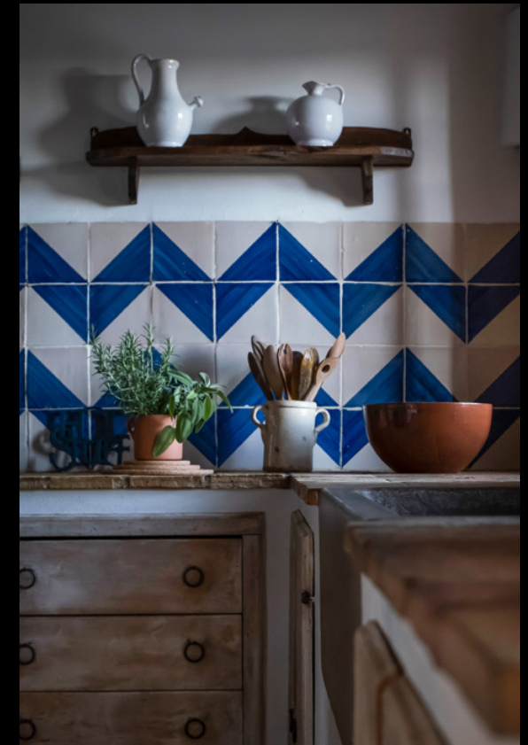
Spacious Kitchen with breakfast table