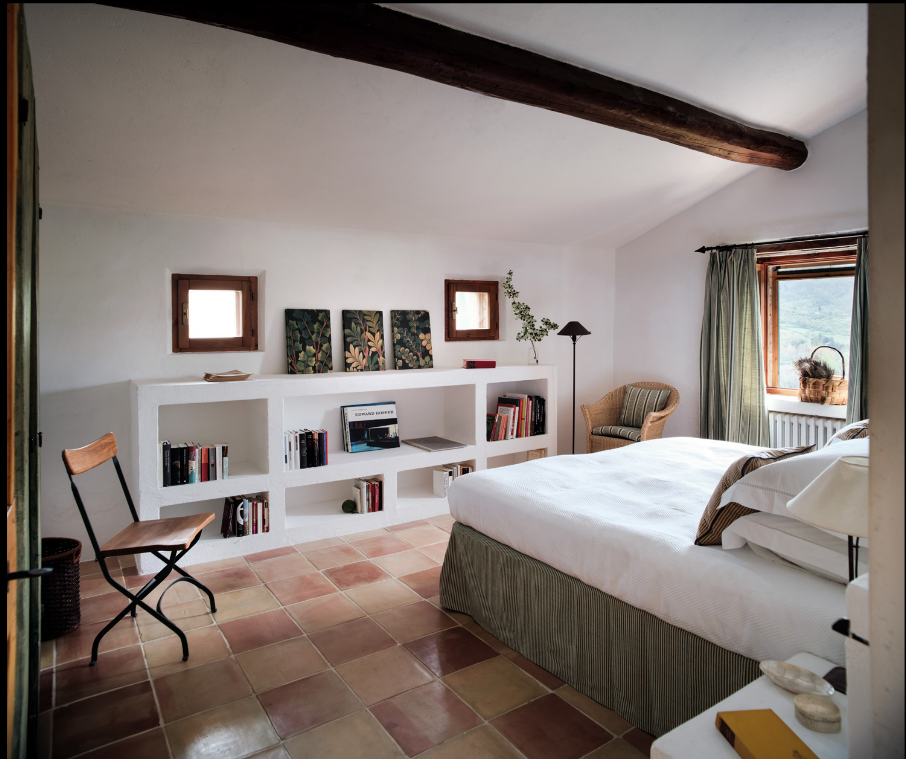
Guest Bedroom in the Gate house