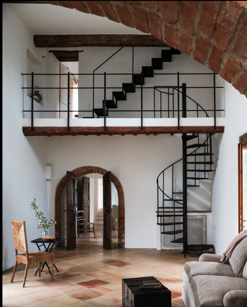
Sitting room details