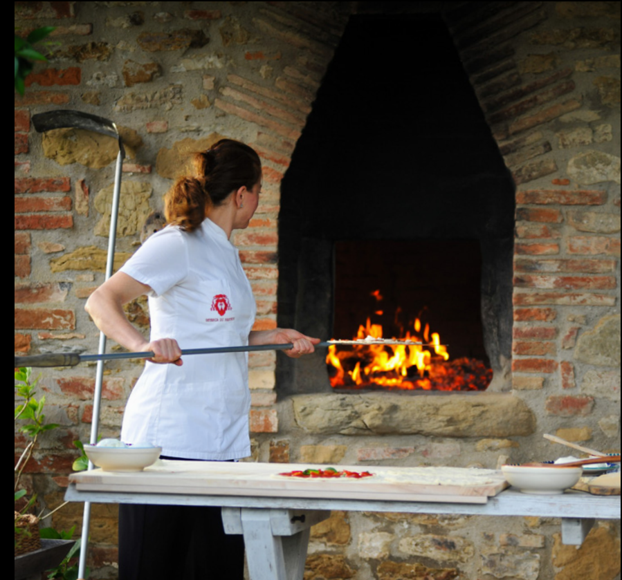
The covered dining Loggia with barbeque grill and bread oven