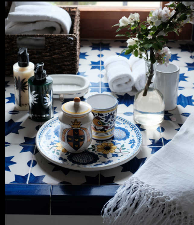
Ground floor Bathroom and detail