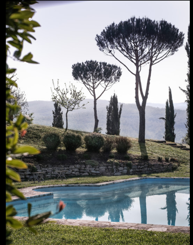
The 12m x 6m heated Swimming pool