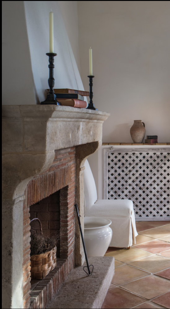
Light filled Dining Room and fireplace detail