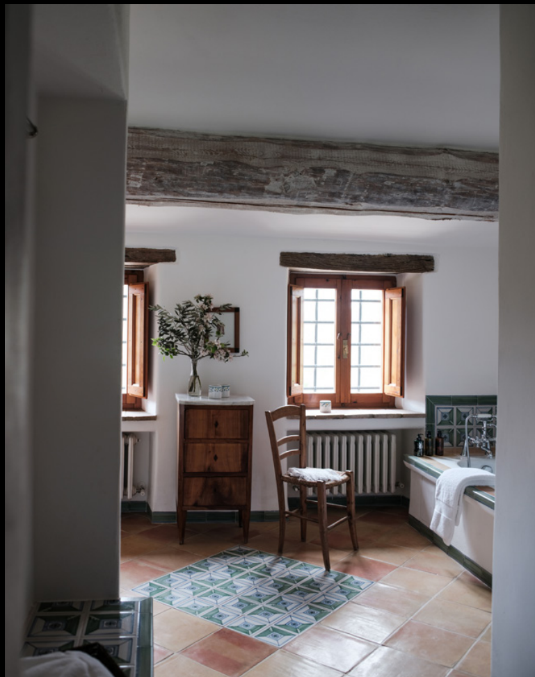
Bathroom on the first floor has Bathtub and also walk-in Shower