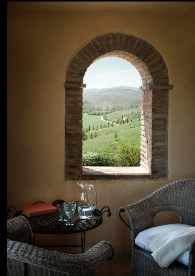
Second floor Loggia off the Tv room