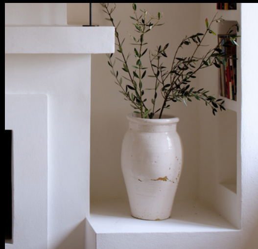
Furnishing and garden details