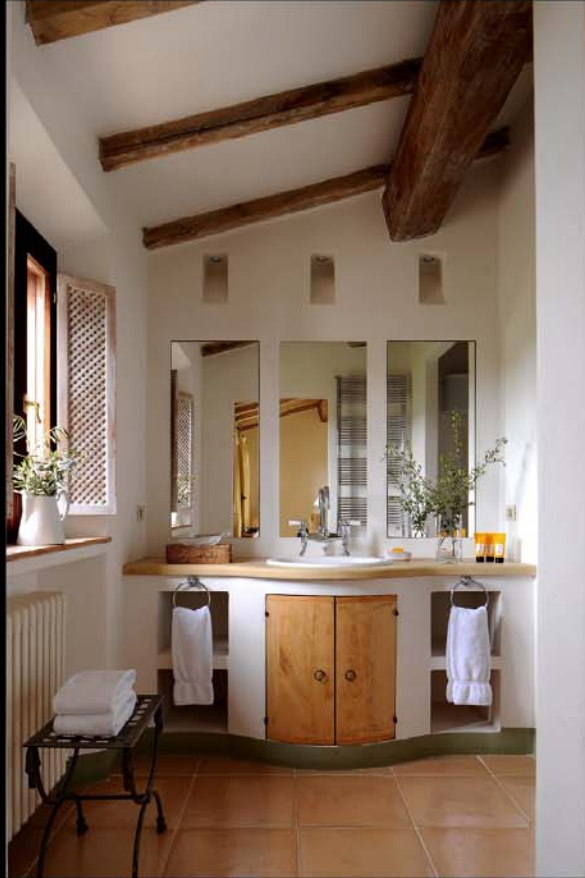
The Guest Bathroom and Bedroom in the Main House