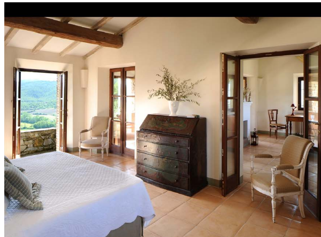
The Master Suite

Page 11- Bedroom leading to Study and private Loggia and out to the garden via external stairs