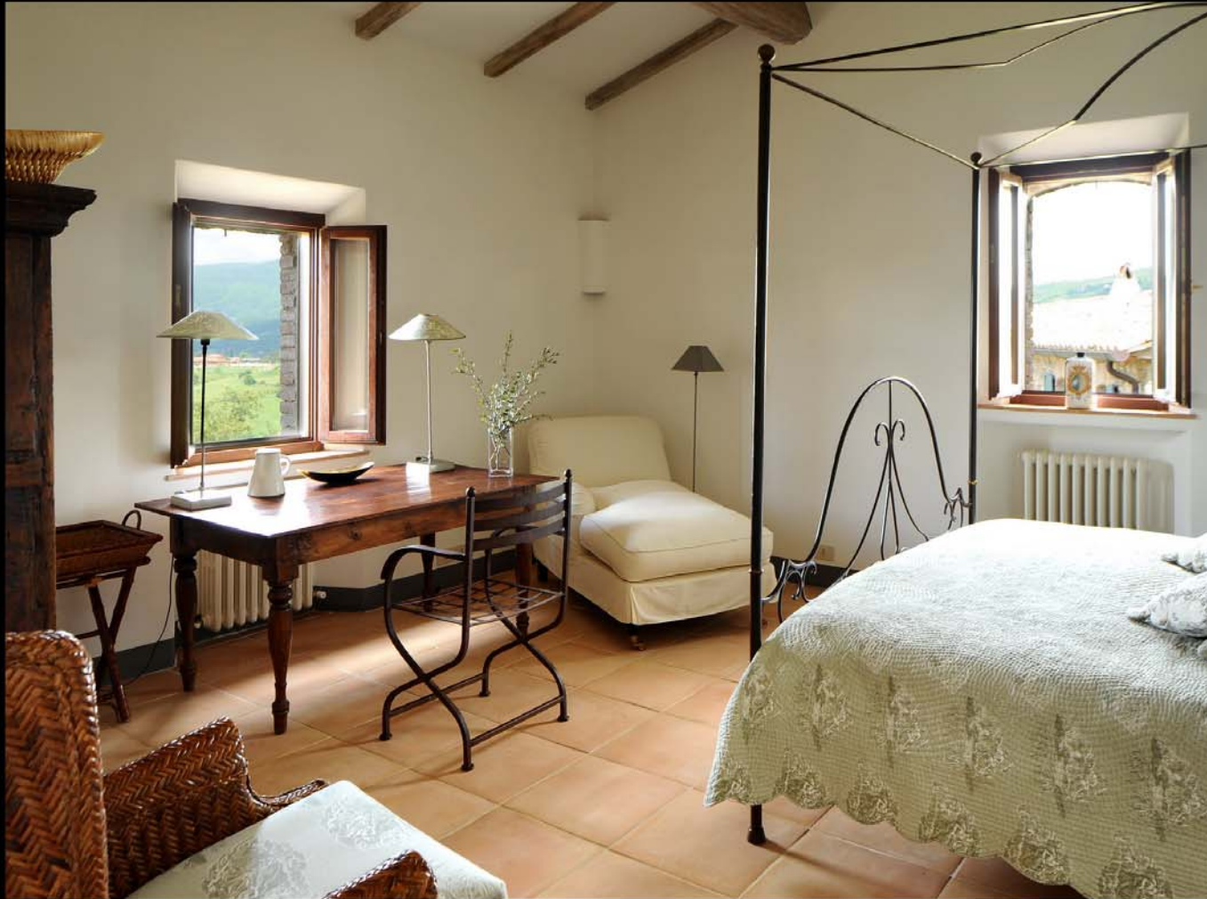
Guest House Bathroom and Bedroom

Back page – Cypress trees flank the Guest House