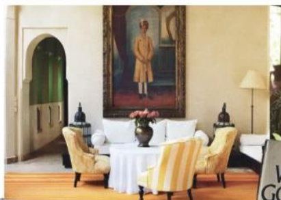
Above, L'Hôtel Marrakech. The White Goddess by Robert Graves, POA, Harrington Books. Lurum mule, £925, Manolo Blahnik