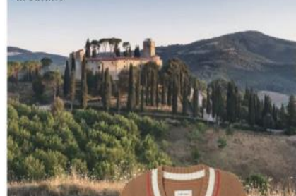
Cardigan, £535, Wales Bonner. Dragon ring, £1,750, Bentley & Skinner