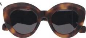
Sunglasses, £280, Loewe

'IF WE ARE TO MAKE REALITY ENDURABLE, WE MUST all nourish a fantasy or two,' as Marcel Proust so wisely said; and I have known many fantasies in the last year, from deepening my spiritual life on a Welsh holy island – an alluring and properly magical destination – to lying in a cabana at the Hotel du Cap, snacking on a sensational club sandwich. Sybaritic as well as spiritual. (But, hey, who's judging?)