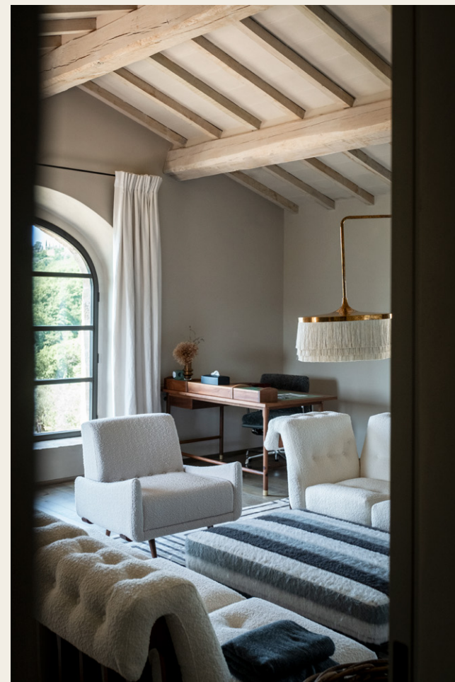
The first floor Sitting Room