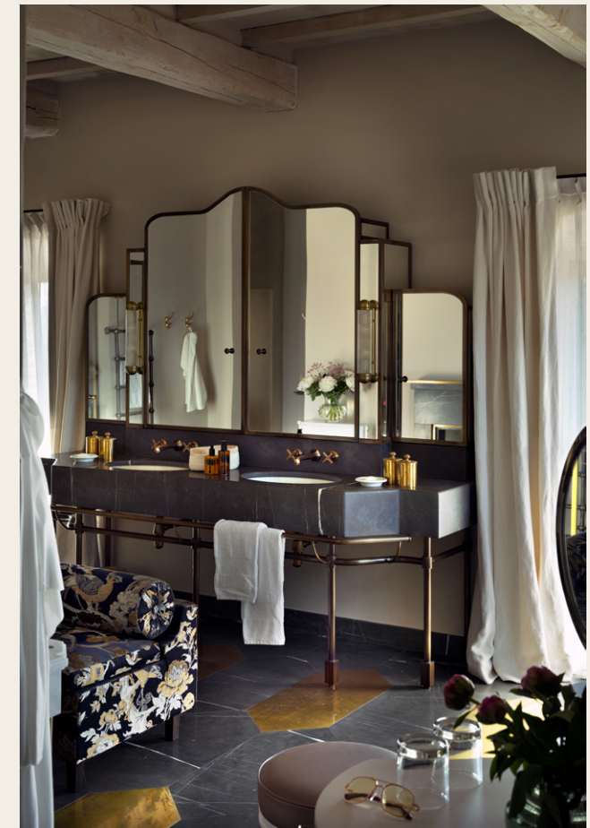
The Master Bathroom on the first floor