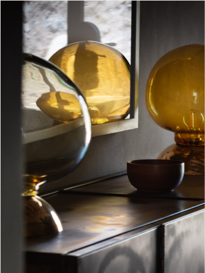
The entrance of Tisciano