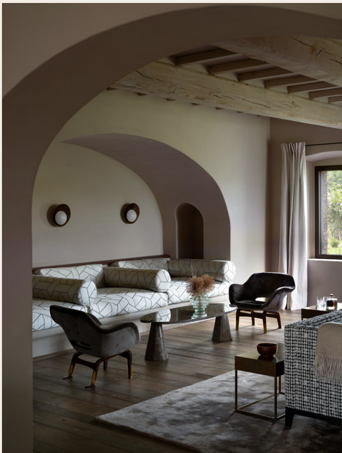
A detail of the Sitting Room