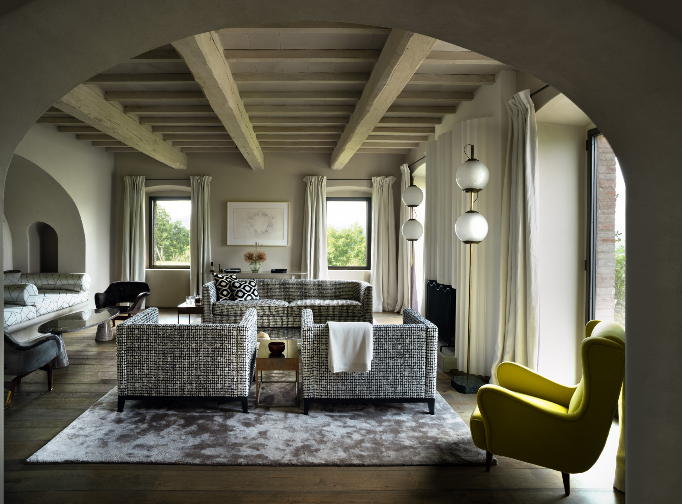
The Sitting Room on the ground floor