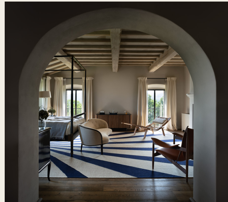
The Master Bedroom on the first floor