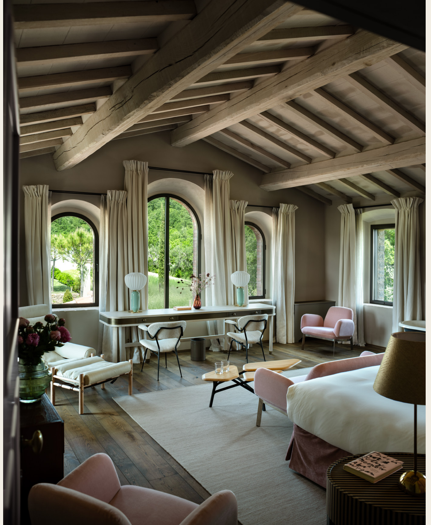
The Guest Bedroom with ensuite bathroom in the main house