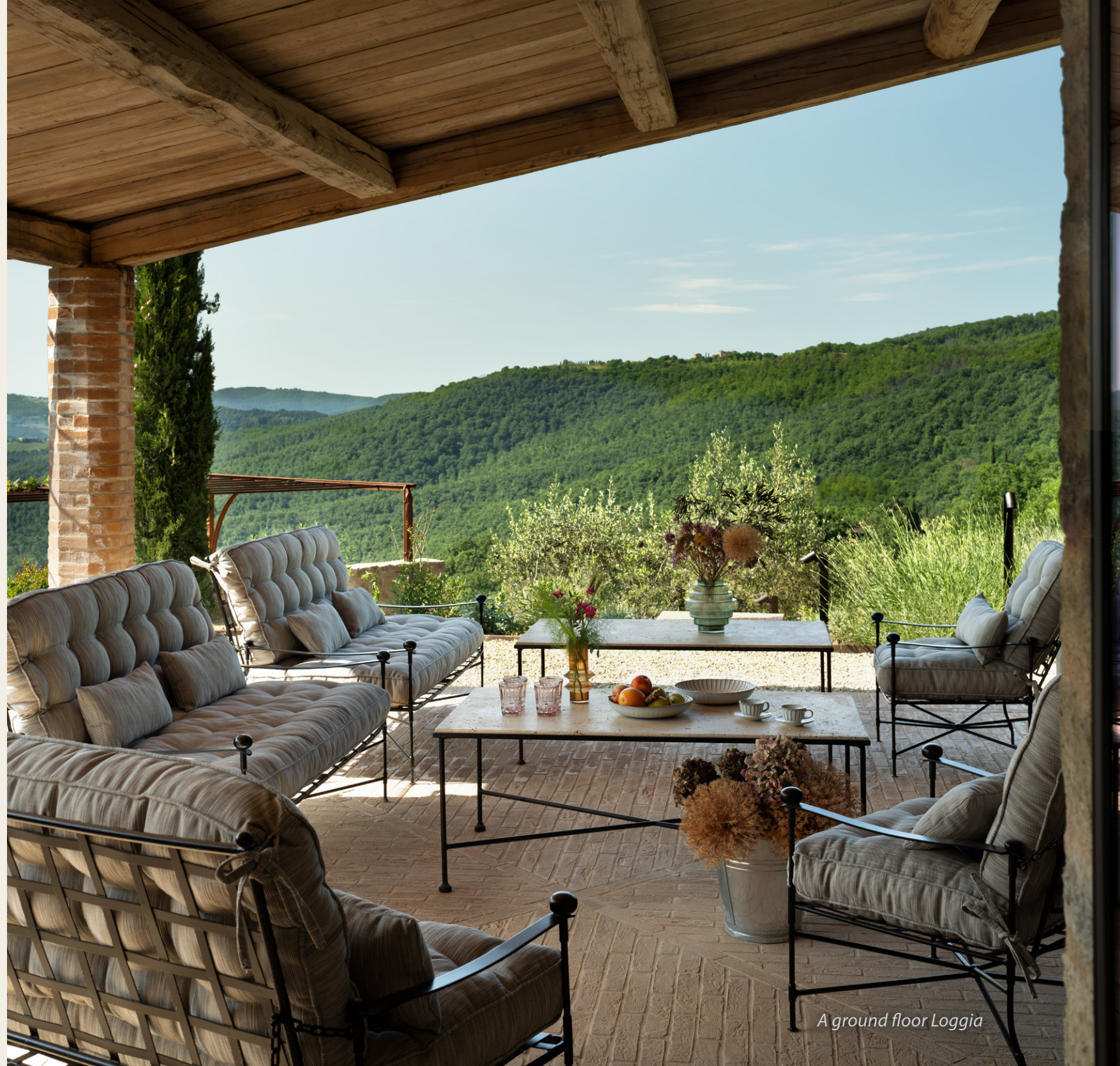
A ground floor Loggia