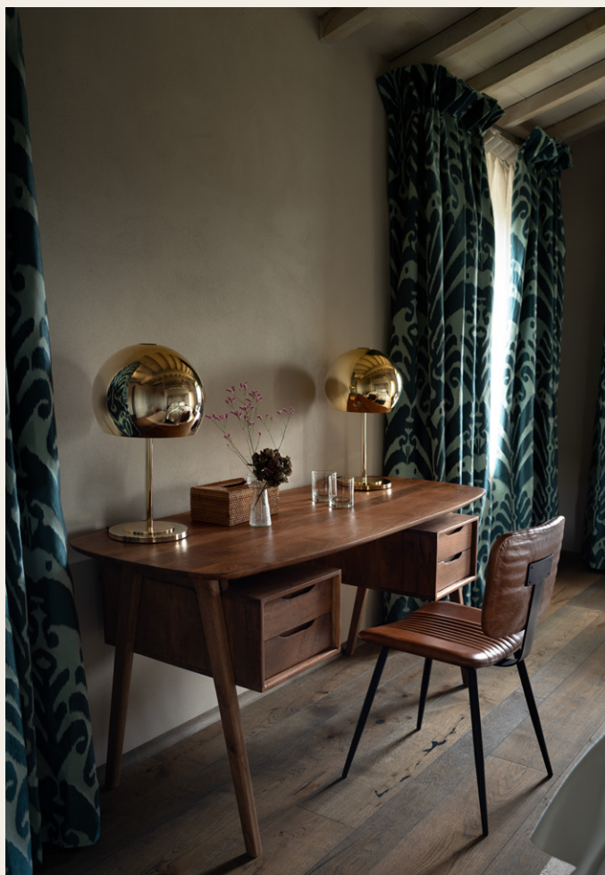
Bedroom on the first floor in the annexe