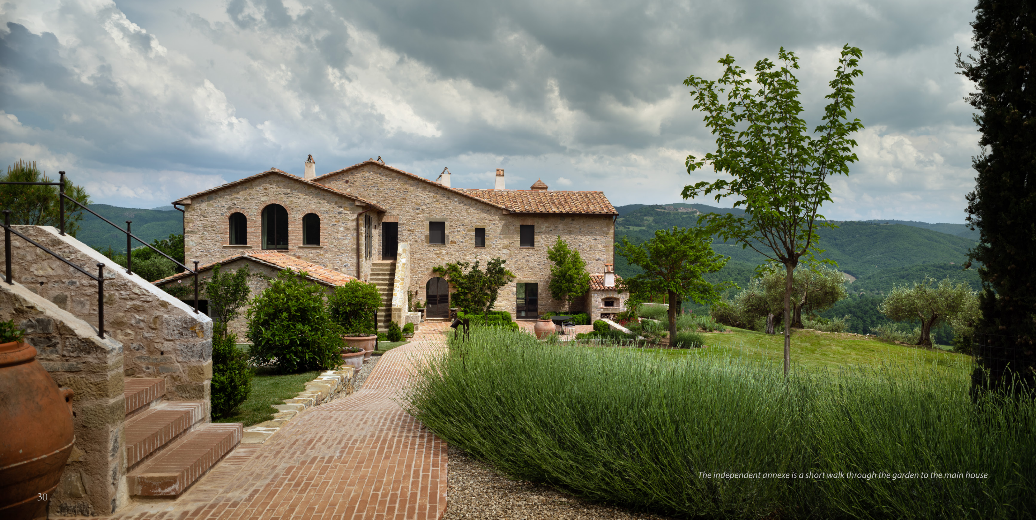
The independent annexe is a short walk through the garden to the main house