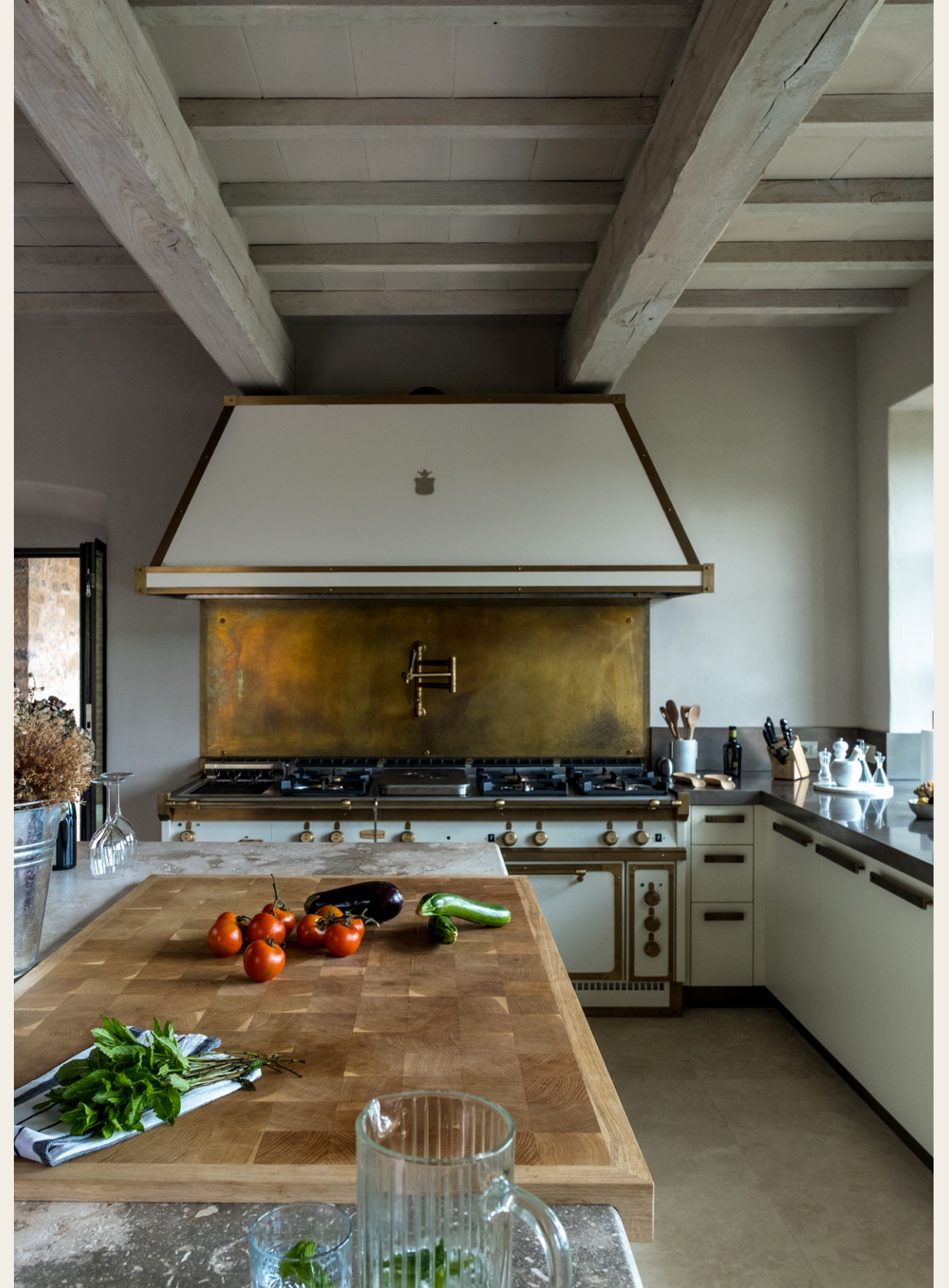
Details of the artisanal Kitchen