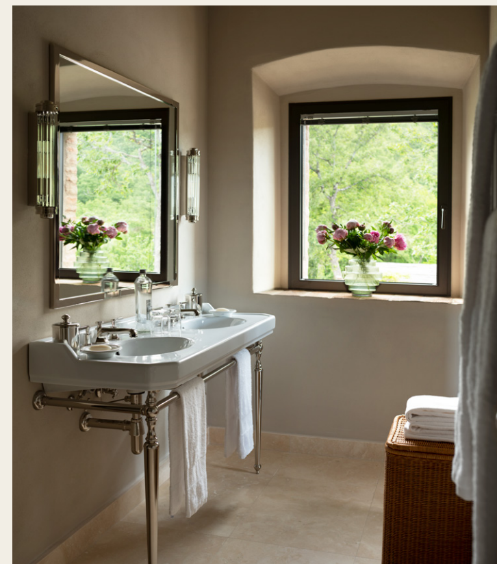
A bedroom with bathroom on the ground floor of the annexe