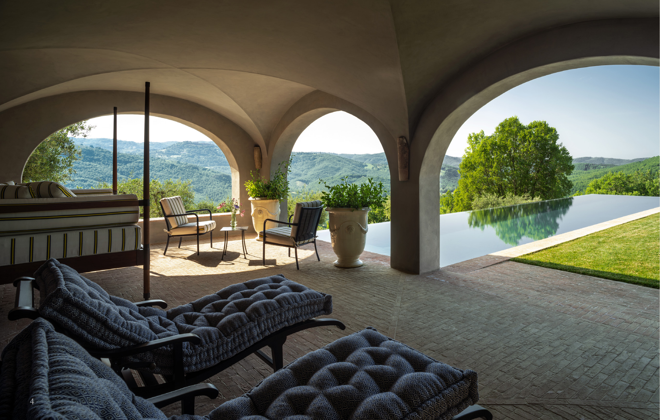
The Swimming Pool Loggia