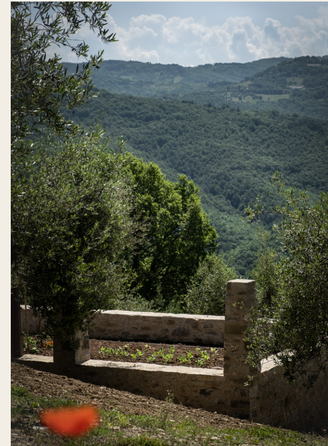
The Pergola with a view through the Reschio Valley