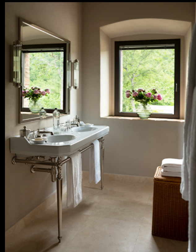
A bedroom with bathroom on the ground floor of the annexe