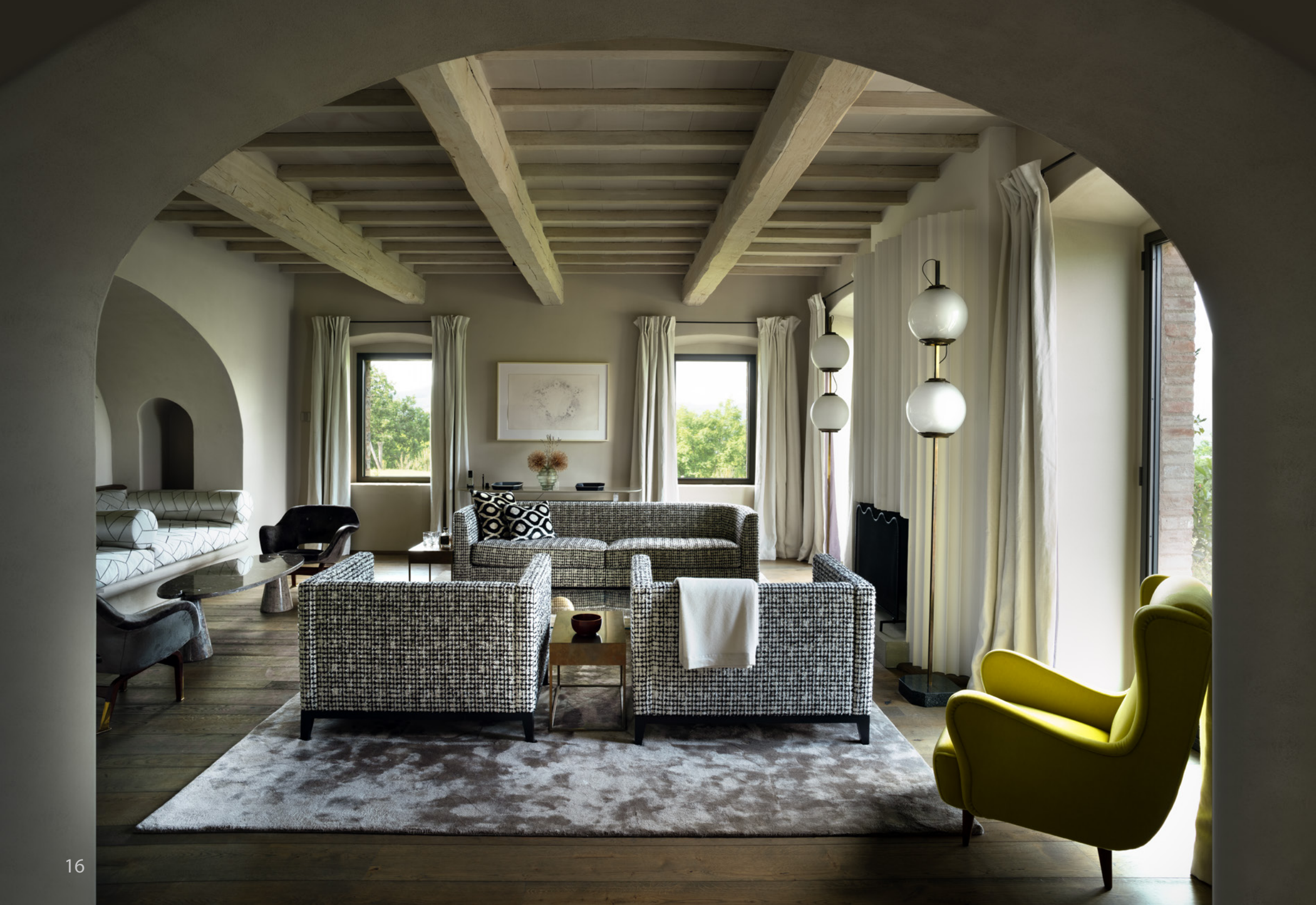
The Sitting Room on the ground floor