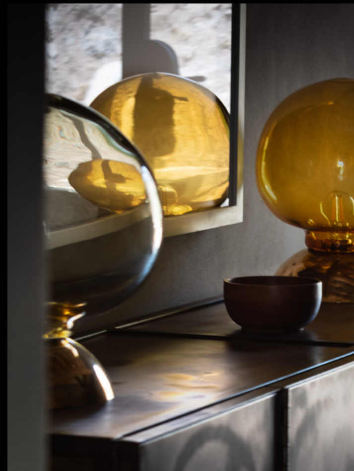
The entrance of Tisciano