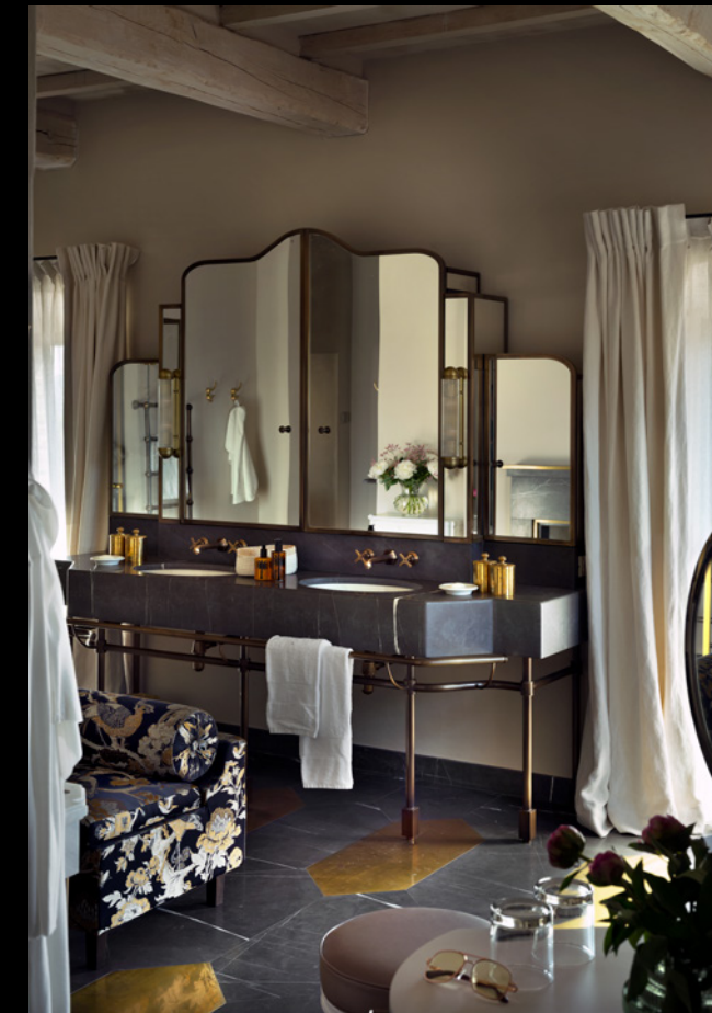
The Master Bathroom on the first floor