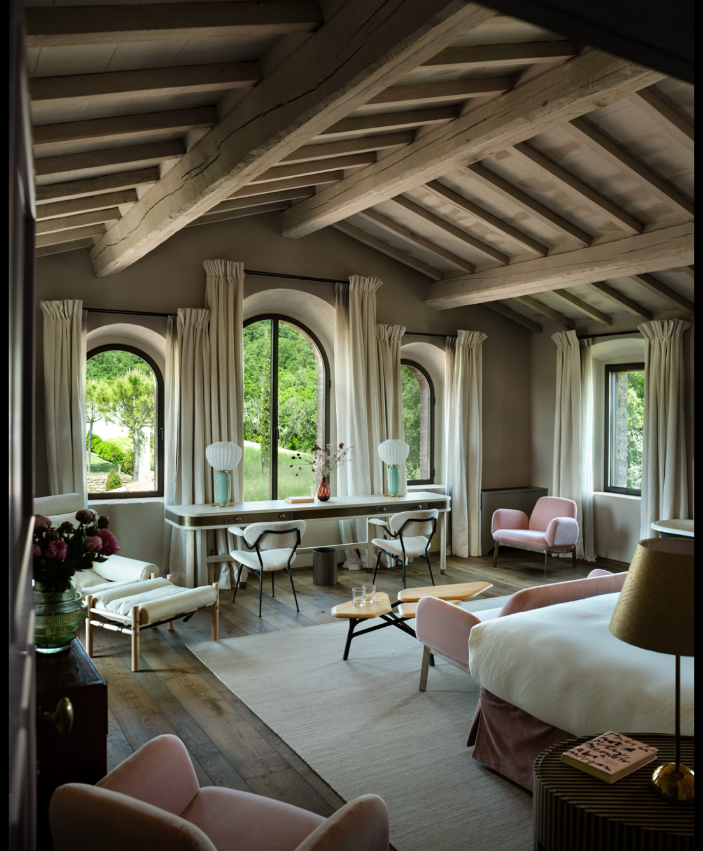
The Guest Bedroom with ensuite bathroom in the main house