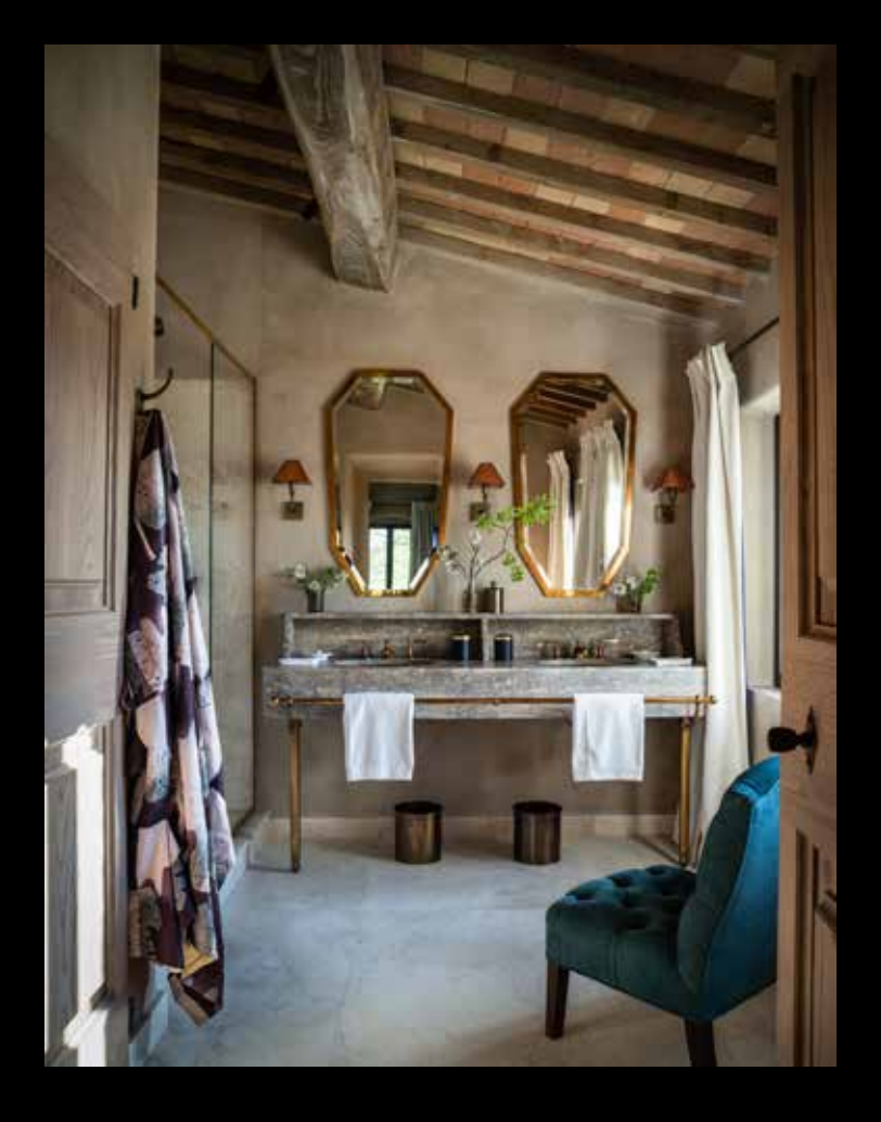
The bathtub within the master bedroom and ensuite shower room