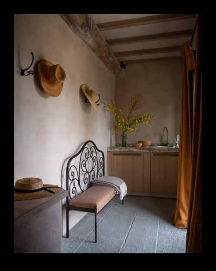
Entrance and bedroom in the independent studio