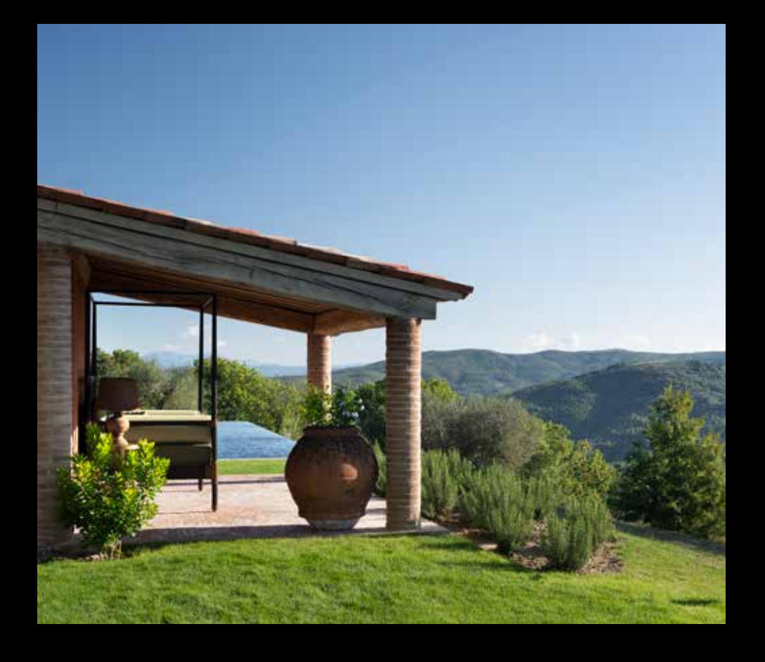
Panoramic swimming pool