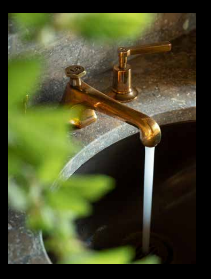
The bathroom in the independent studio