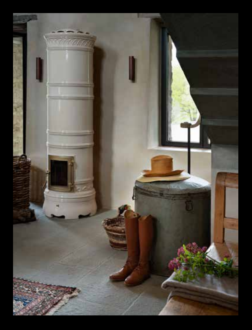
The light filled hall and wood stove detail