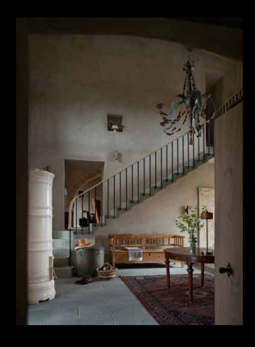
Approach to the hall from a guest bedroom