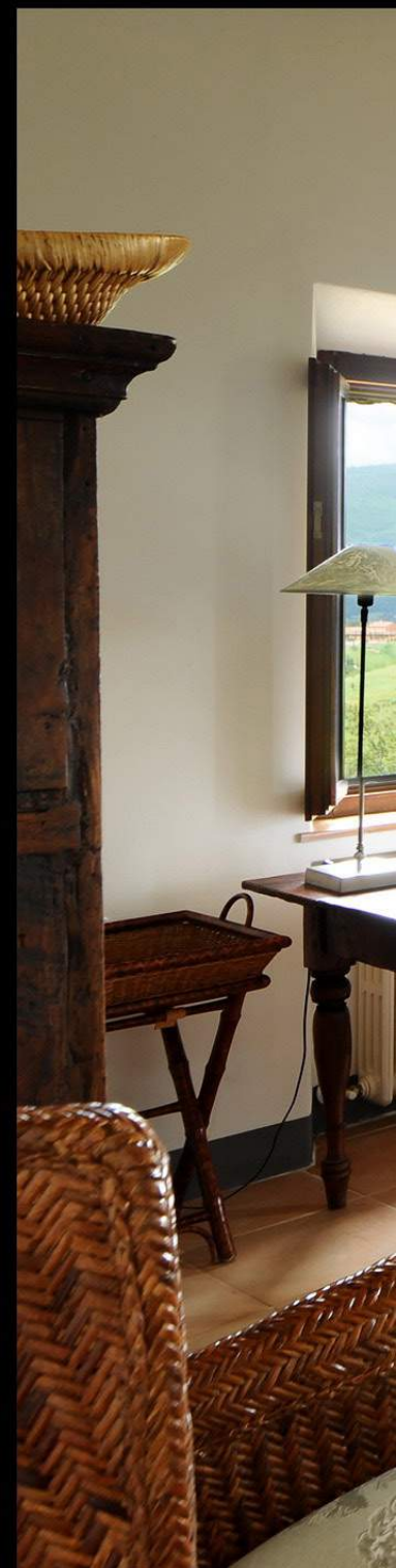
Guest House Bathroom and Bedroom

Back page – Cypress trees flank the Guest House